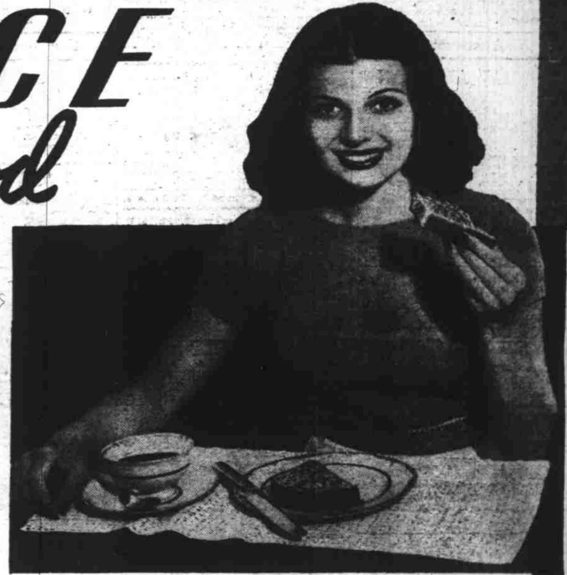
RITA HAYWORTH Featured in "It Happened in Paris" A Columbia Production