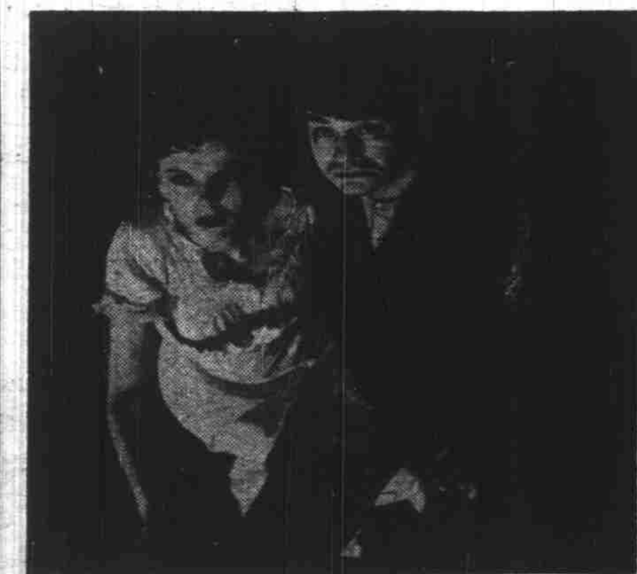
Drama Afloat—Idá Lupino and Edward G. Robinson in Jack London's immortal story of floating terror, "The Sea Wolf," which opens on Saturday at the Elsinore. John Garfield is starred with them.