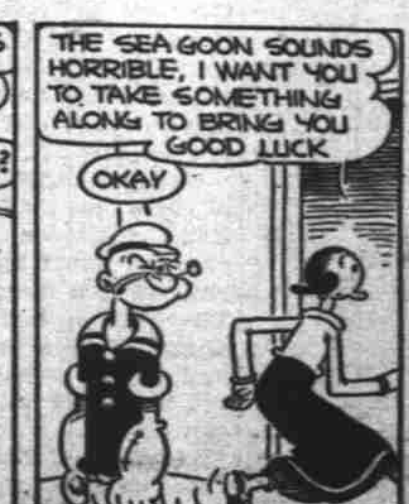
YAS, THE SEA GOON SAYS HE WILL KILL ME DEAD, BUT I HAFTA GO, PLEASE DO NOT WORRY WHO IS THE SEA GOON NOBODY KNOWS!