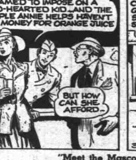
YOU MEAN THE LITTLE GIRL OWNS THIS STAND AND IS GIVING ORANGE JUICE OUR CUSTOMERS WOULD BE ASHAMED TO IMPOSE ON A KIND-HEARTED KID LAND THE PEOPLE ANNIE HELPS HAVEN'T ANY MONEY FOR ORANGE JUICE AWAY FREE ?? IT DOESN'T MAKE WHAT I THOUGHT WHEN SHI