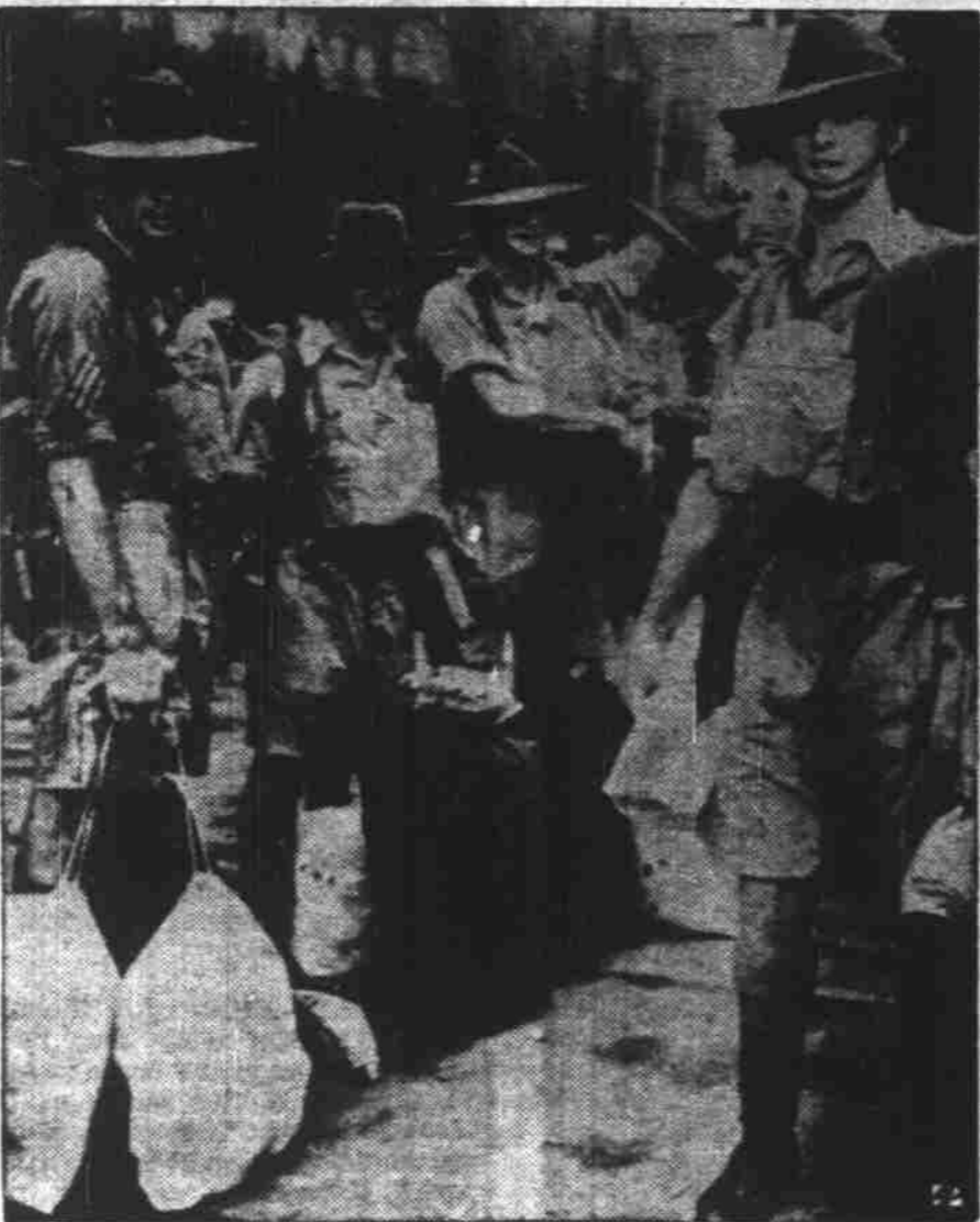
Australian troops sent to Singapore and the Malay peninsula to bolster the British empire's defenses against "any eventuality" stand at ease beside their kit bags while waiting for trains to take them to undisclosed positions on the Malay peninsula.