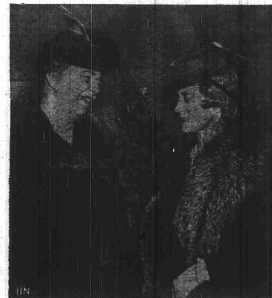
Mrs. Franklin D. Roosevelt, wife of the U. S. president, was the ranking guest of honor at a tea given in Washington by Viscountess Halifax, wife of the new British ambassador to the U. S.