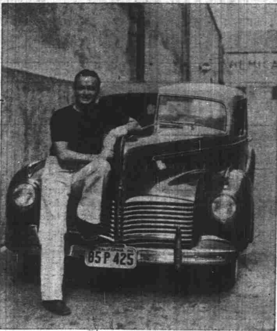
Bob Hope (above), radio wag and film funster, steps off the set of Paramount's "Road to Zanzibar", where this week he resumed his comedy making with Bing Crosby and Dorothy Lamour, for a preview of Hudson's new 1941 Commodore Eight Sedan. Without wisecracks, Hope was high in praise of Hudson's style-setting, eye-catching, symphonically-styled series of sleek sedans.