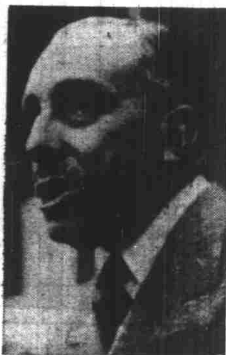
Former King Alfonso

Former King Alfonso XIII, 54, of Spain, is seriously ill in Rome of heart trouble, according to dispatches. Recently, he signed a proclamation giving up his right to the throne in favor of his son, Juan, Prince of Asturias.