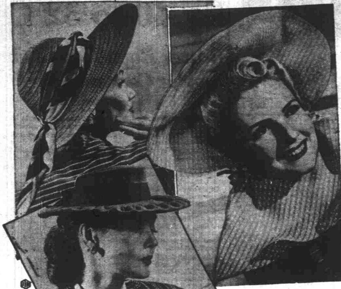
Top left, large woven grass hat; below, felt hat with pie-crust brim; right, chapeau with matching bib.

This season the relation between the new hats and the hair arrangement are closer than ever. The position you wear your hat on your head will depend largely on how you do your hair. It's entirely up to you whether you should wear your chapeau forward, behind the pompadour, or straight on your head. The large hat, top left, is called "Jungle Reed," and is woven of native South American grass in natural color. It may