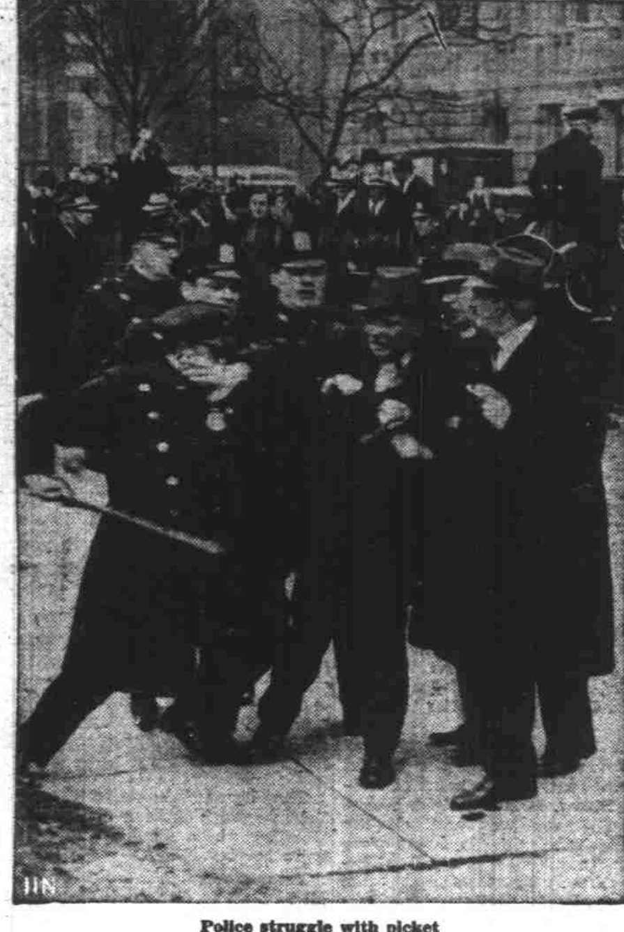
Police struggle with picket

Police struggle with a picket at New York's Battery where an intraunion jurisdictional dispute at the site of construction of the new Battery-Brooklyn tunnel has resulted in frequent clashes. Police and pickets clashed, resulting in the arrest of six and cuts and bruises to several others. Note the club in hand of policeman at left.