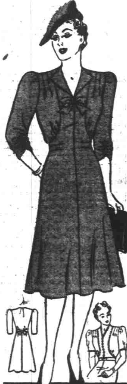
Club meeting . . . luncheon . . . matinee . . . tea-time—this handsome Anne Adams dress will take every activity in its stride. It's Pattern 4628, and quick as a flash to stitch up with Sewing Instructor's aid. The unbroken, flowing lines created by the in-line skirt and center bodice sections are very slenderizing. The darts at each side-waist give smooth fitting, and the curved seams made by the very soft side bodice sections are most decorative. Add a matching or contrasting revers-and-bow trim . . . or just have a collarless V-shaped neck with feminine lace edging and button trim down the center seam. A front-buckled or buckled belt is optional; your sleeves may be three-quarter with dressy gathers or short and tucked.

Pattern 4628 is available in women's sizes 36, 38, 40, 42, 44, 46 and 48. Size 36 takes 3 1/2 yards 39 inch fabric.