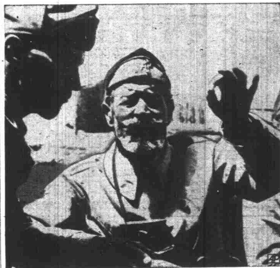
British reported the capture of more than 80,000 Italians in the "suicide garrison" at Bardia, Lybia, along with their commander, Gen. Annibale Bergonzoli (facing, arm upraised). Gen. Bergonzoli is known to the British as "Electric Whiskers."