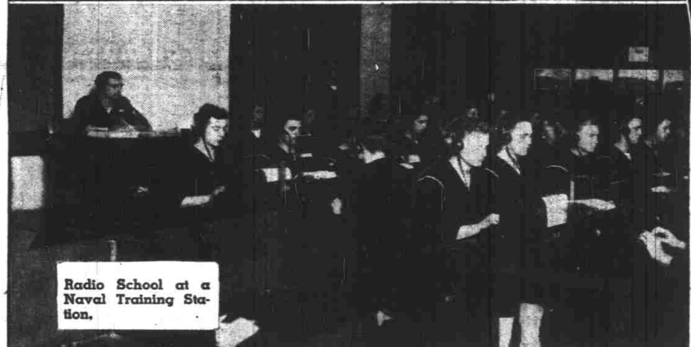
Radio School at a Naval Training Station.