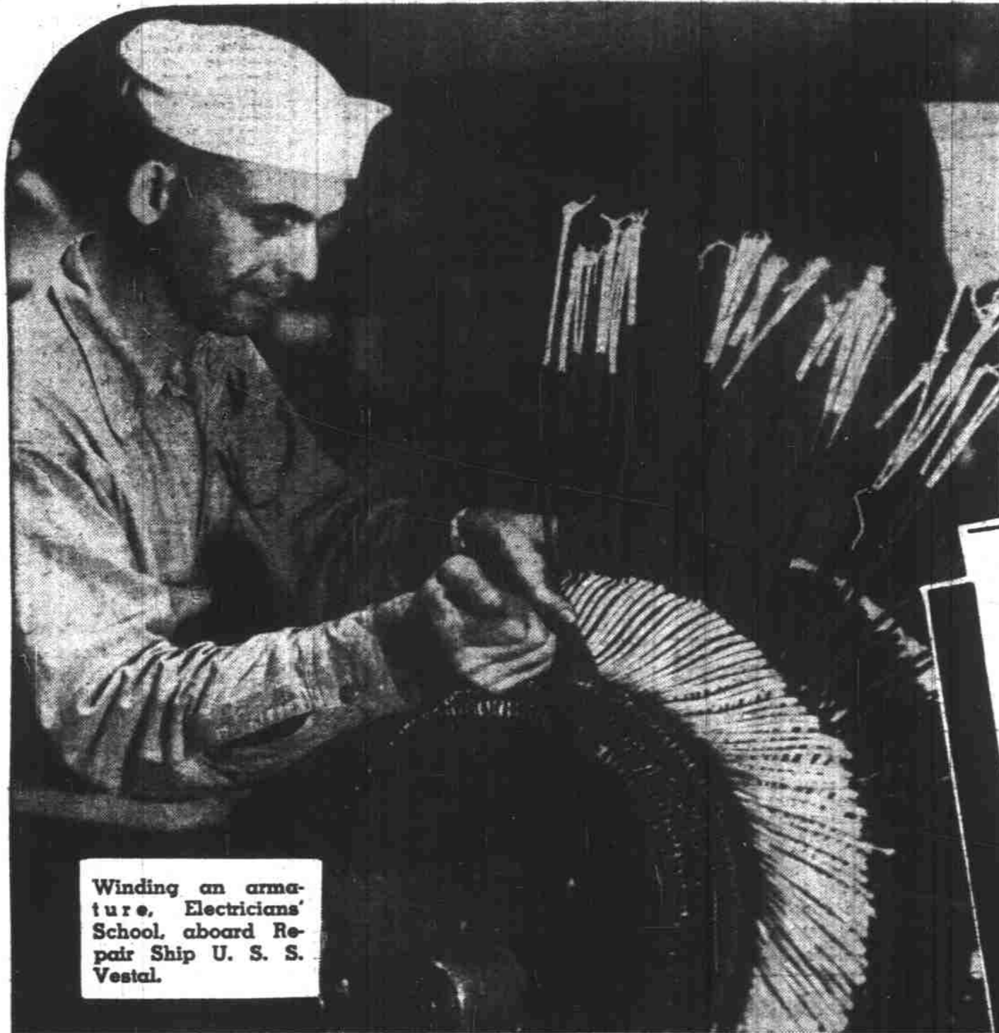
Winding an armature, Electricians' School, aboard Repair Ship U. S. S. Vestal.