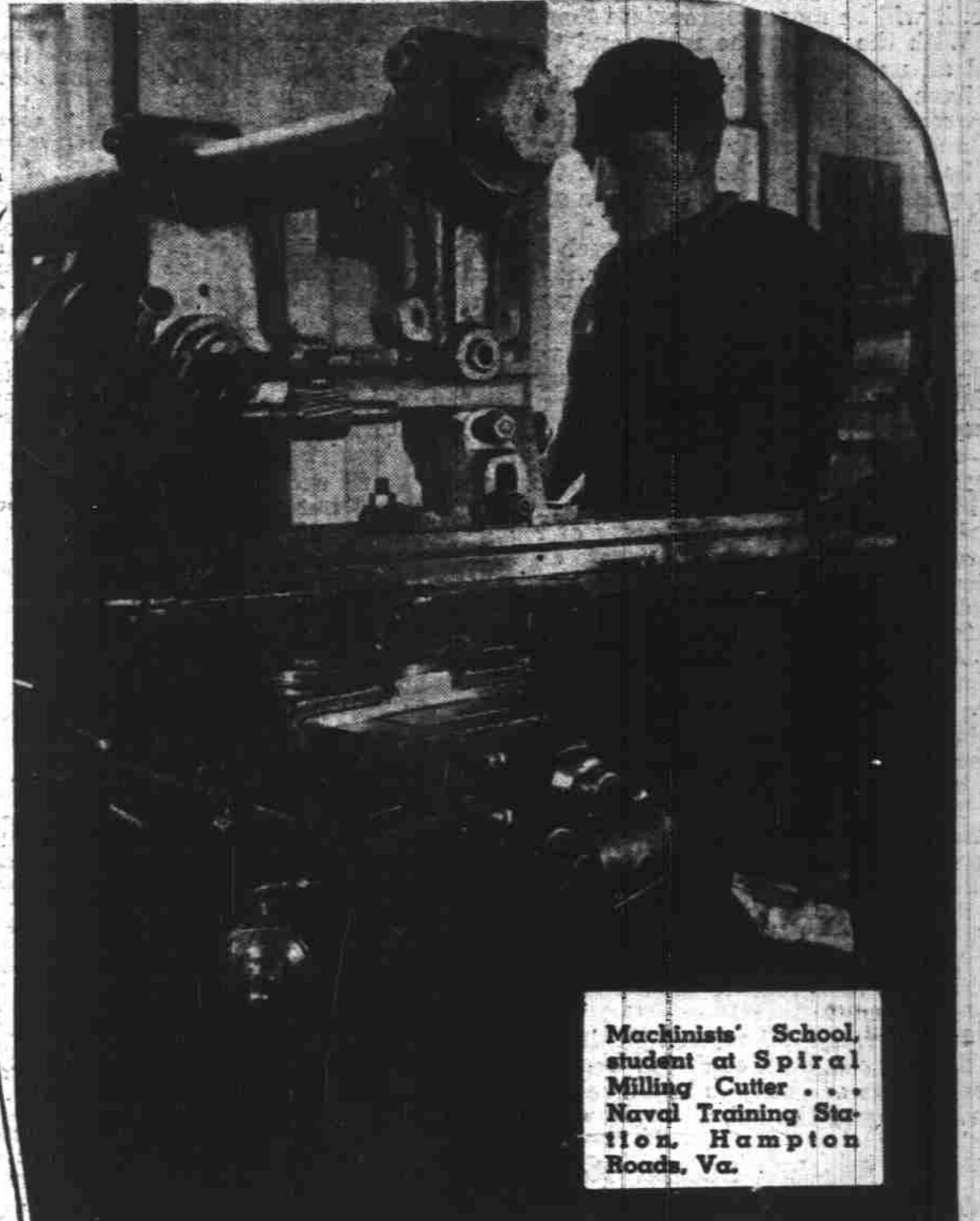
Machinists' School, student at Spiral Milling Cutter . . . Naval Training Station, Hampton Roads, Va.