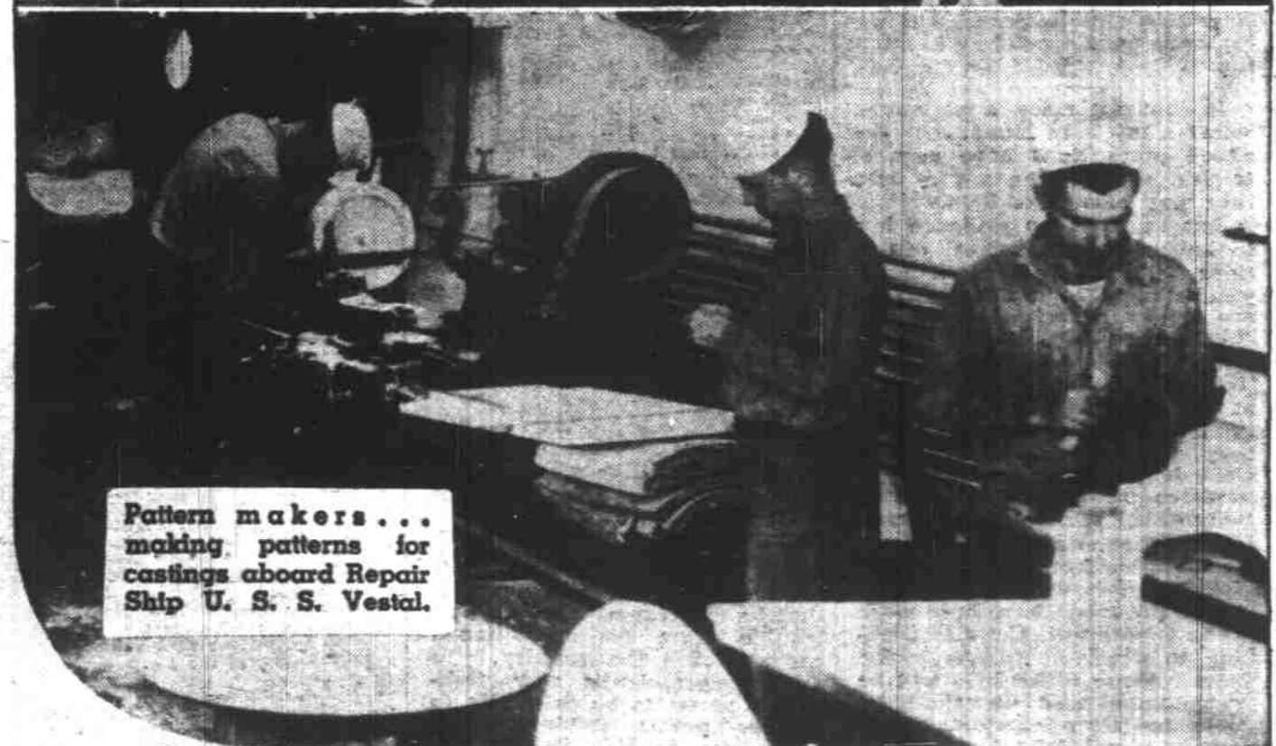
Pattern makers . . . making patterns for castings aboard Repair Ship U. S. S. Vestal.