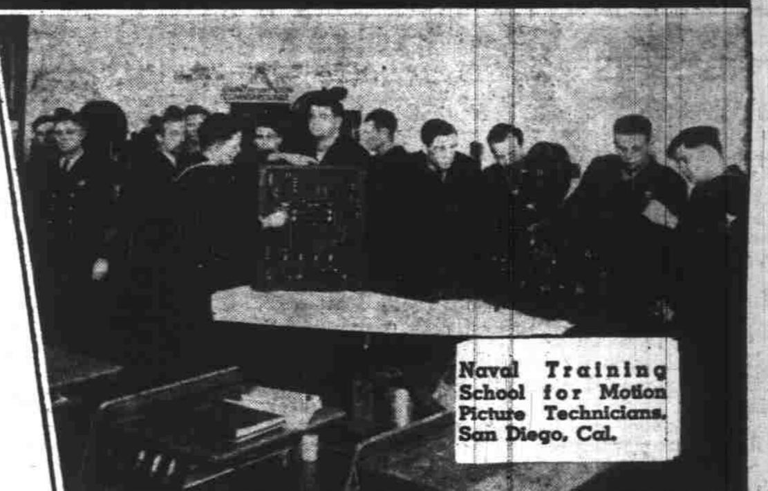
Naval Training School for Motion Picture Technicians, San Diego, Cal.