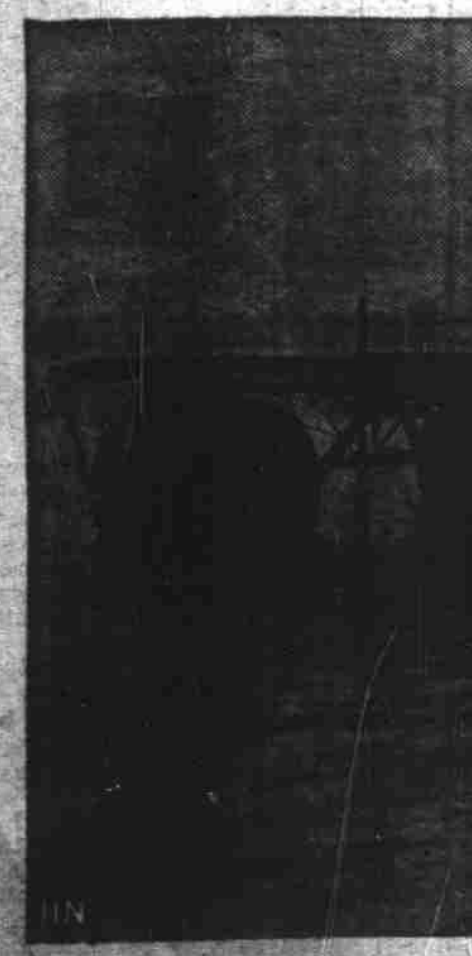
This queer looking torpedo boat is the invention of a Windsor, Ontario, Canada, man who thinks it can go between 200 and 300 miles per hour. The best in design.