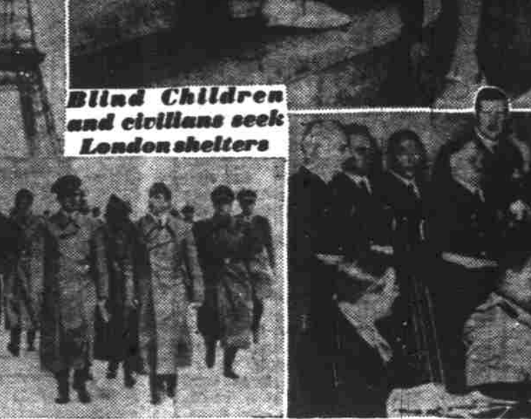
Adolf Hitler visits occupied Paris