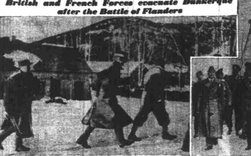
Norwegian King Haakon flees Germans