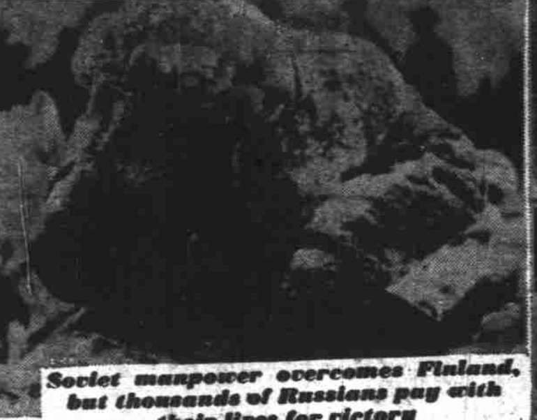
Soviet manpower overcomes Finland, but thousands of Russians pay with their lives for victory