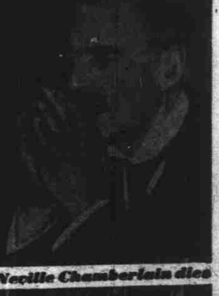
Neville Chamberlain dies