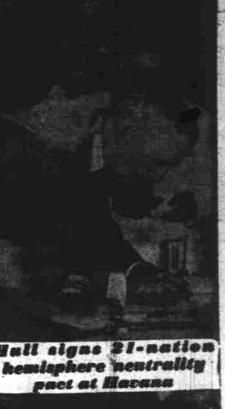
Hull signs 21-nation hemisphere neutrality pact at Havana