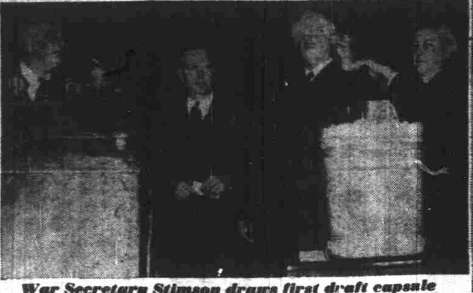
War Secretary Stimson draws first draft capsule