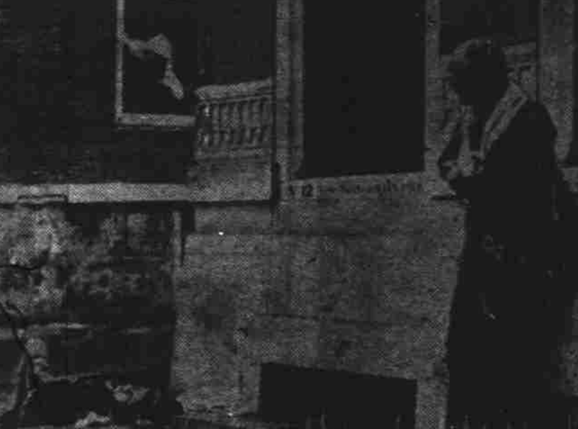
The German blitzkrieg sweeps through Holland