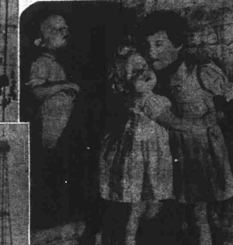
Blind Children and civilians seek London shelters