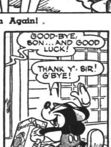
Not a Fair-Weather Friend!