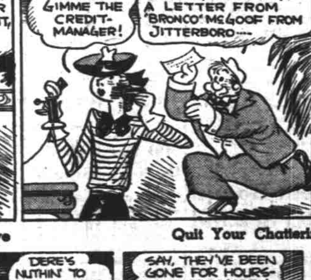
THIMBLE THEATRE-Starring Popeye