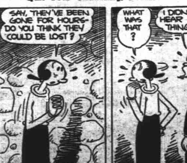
Quit Your Chattering, Teeth!