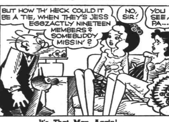
It's That Man Again!