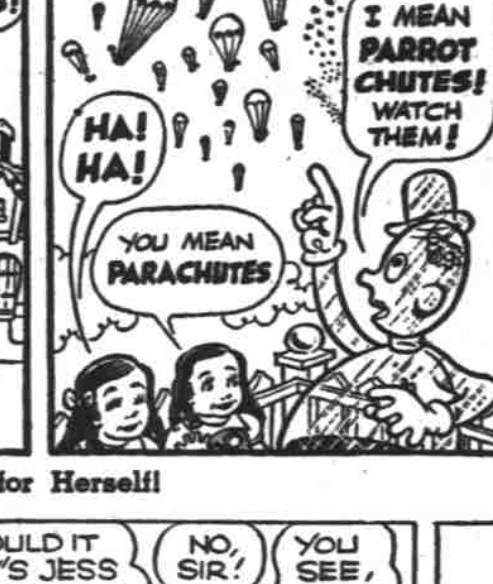
Everybody for Herself!

I SEE! AND PERHAPS. MAYBE A GIRL FRIEND, EH?