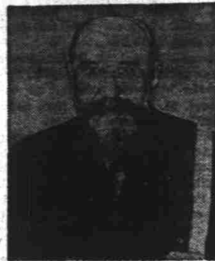
Nicholas Jorga Known in the U. S., from his lecture tour of several years ago, Nicholas Jorga, former Rumanian premier, was shot and killed in that Iron Guardist purge of former government leaders in the Balkan country.