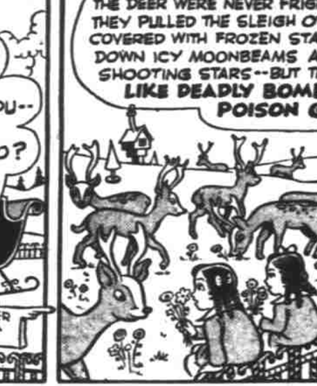
By CLIFF STERRET