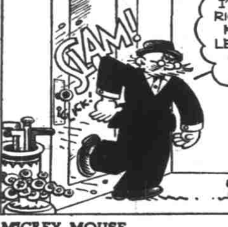
By WALT DISNEY