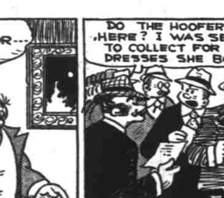
By WALT DISNEY