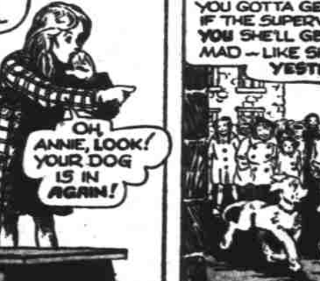
By WALT DISNEY