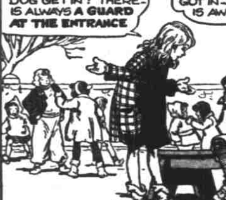
By WALT DISNEY