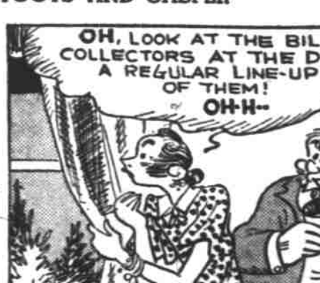
By WALT DISNEY