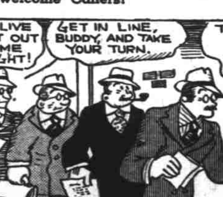
By WALT DISNEY