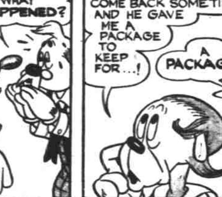
By WALT DISNEY