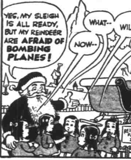
POLLY AND HER PALS