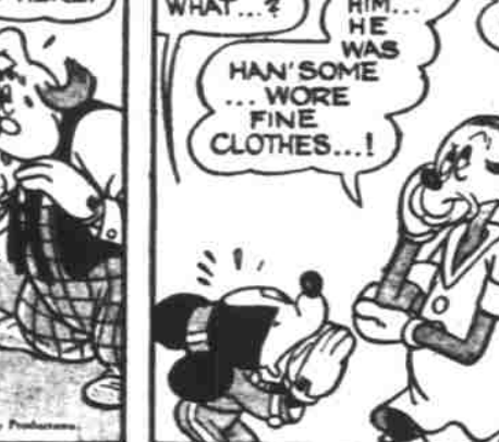
By WALT DISNEY