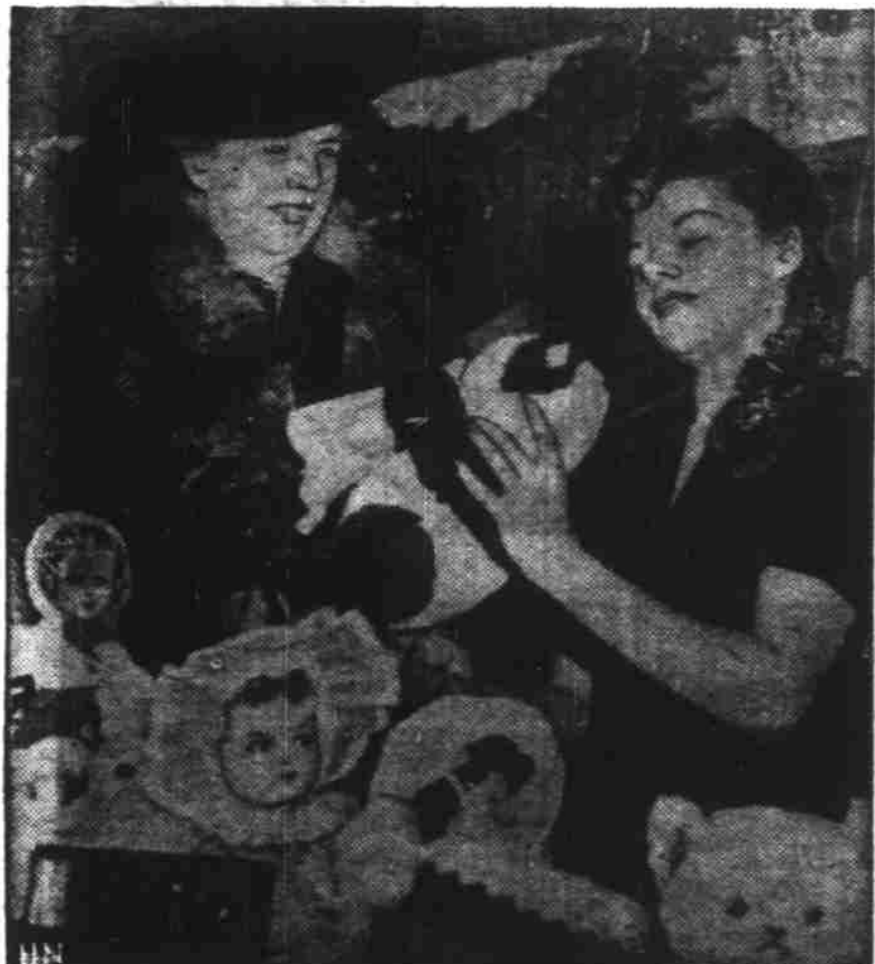
As always an early Christmas shopper, Mrs. Franklin D. Roosevelt, wife of the president, already is Christmas shopping in New York. Mrs. Roosevelt selects a toy from a salesgirl for one of her grandchildren.