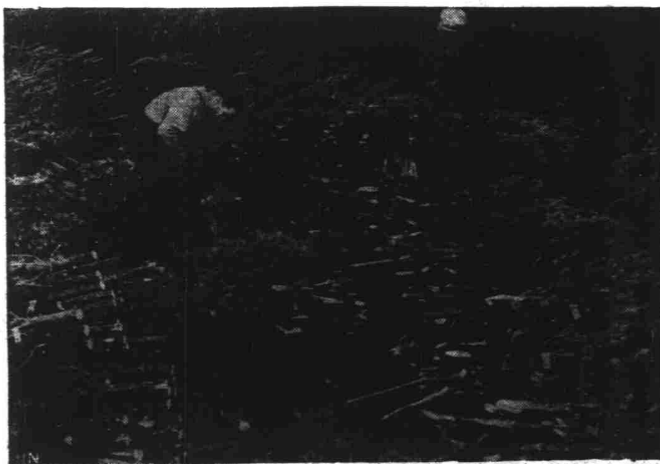
It won't be long until Christmas, no sir! Christmas trees already are being cut, stacked and tied for shipping to all parts of the globe. This picture was taken at Shelton, Wash., which state is regarded as one of the largest producers of Christmas trees in the world.