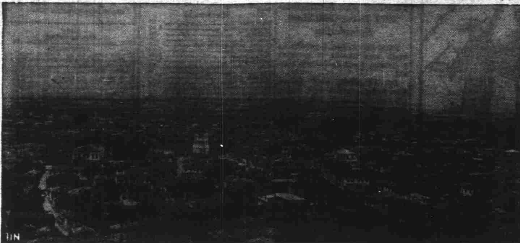
Here is a view of Koritza, Albanian mountain city and an Italian munitions depot which has been taken by the Greeks after a six-day siege. According to reports from Koritza, the populace celebrated their "freedom" when crowds filled the streets, burned portraits of Italian King Victor Emmanuel and others and brought out pictures of the Greek leaders, including King George and Premier Metaxas.