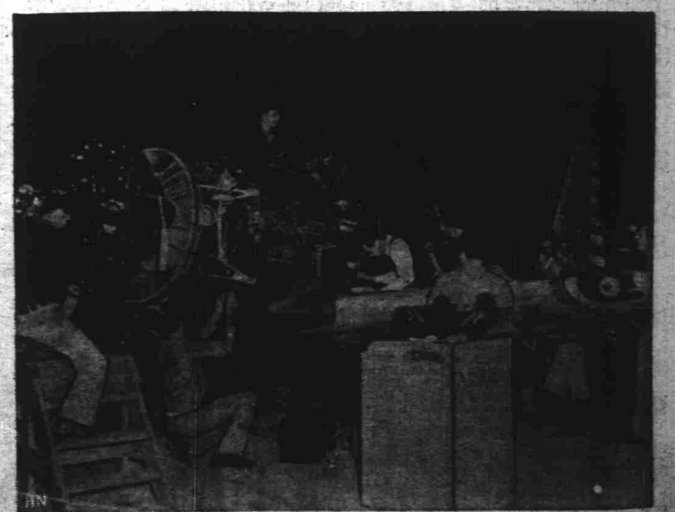
Returning to work after a 12-day strike at the Vulcan Aircraft plant at Downey, Calif., workers are being urged at the production of an army of new planes. The workers were released and signed a 10-month no-strike clause. The plant is among many busy on government defense orders.