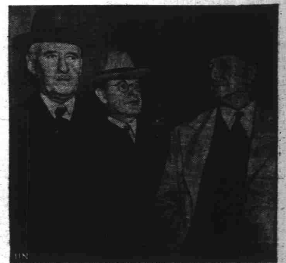
Stimson, Hillman and Knox