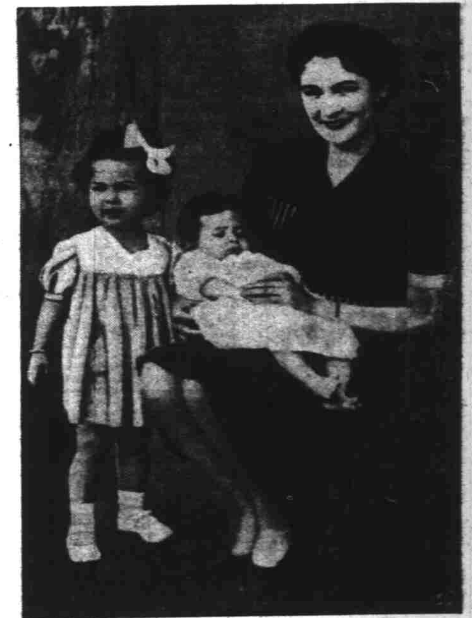
ROYAL FONDNESS FOR 'F' —F leads as the alphabetical favorite with Egypt's royal family. Here are Queen Farida, 26, with her elder daughter, Ferial, almost two, and baby, Fawzia, who was born in April. Egypt's king is named Farouk.