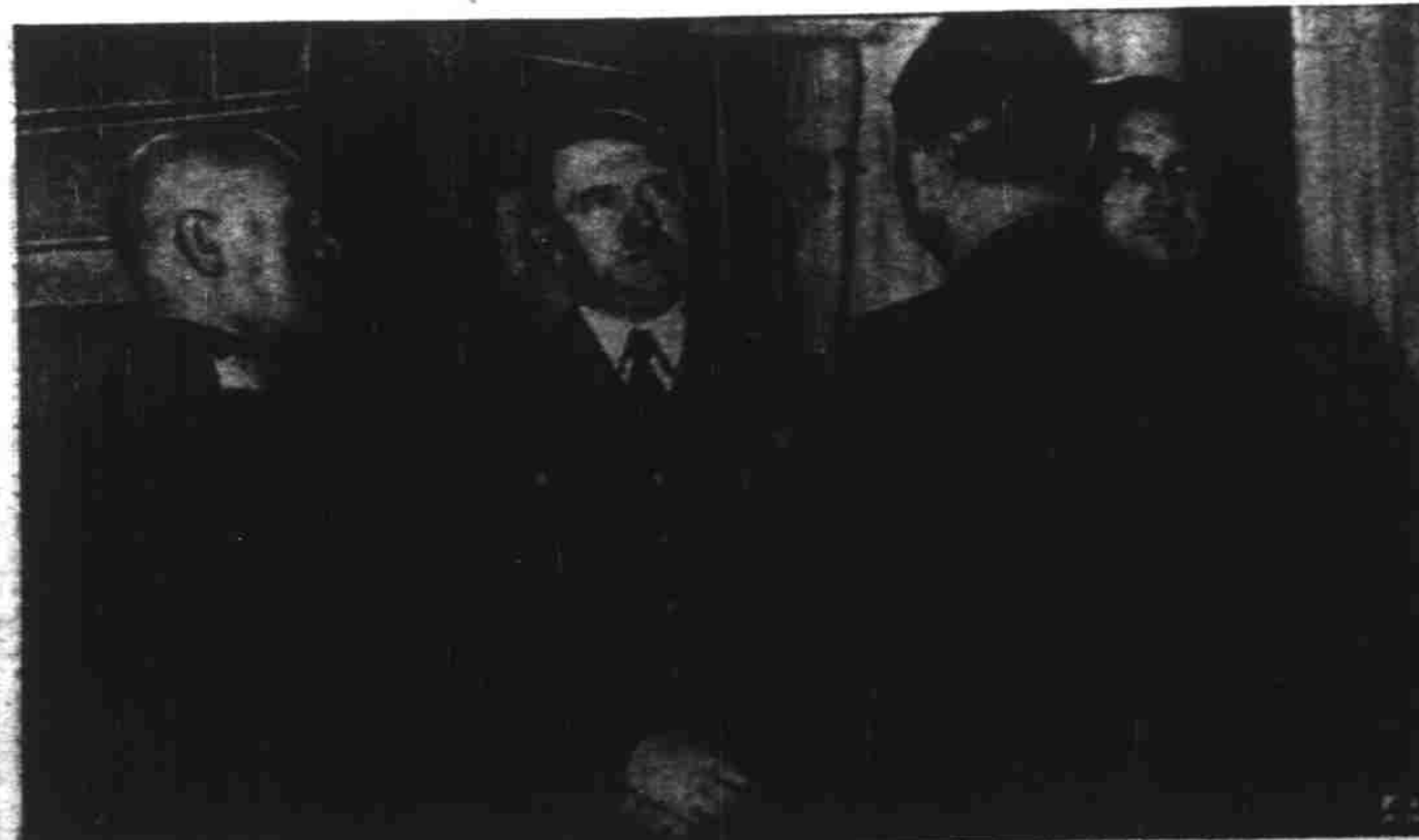
THE FACES LOOK FAMILIAR —"Mr. Four" of the Axis powers were deep in conversation that possibly concerned their plans for Europe and parts east, west, north and south when this was made at Florence, Italy. Left to right: Premier Mussolini of Italy; Chancellor Hitler of Germany; Foreign Minister von Ribbentrop of Germany; Foreign Minister Ciano of Italy.