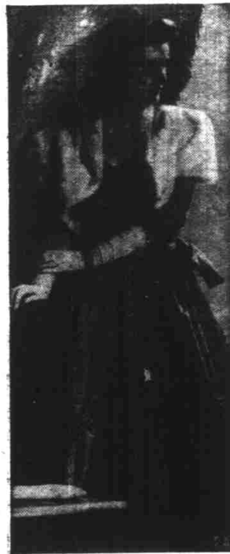
IN STEP —Opening of the opera Dec. 3 in New York sets the pace in fashion, and this miss is more than prepared. For her Big Moment, she has an American beauty with fabled inflexible with swathed hips, set off by an ermine bolero.