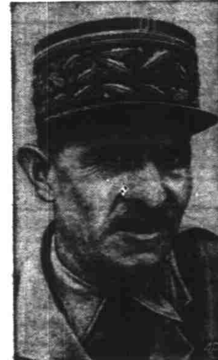
FRENCH —When Britain and the "Free French" forces of De Gaulle tried to take Dakar, French West African capital, General Barrau (above) commanded French land forces.