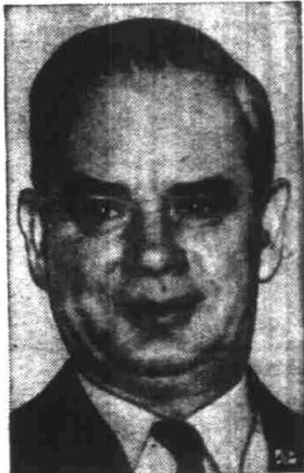
CHOSEN —Philip Murray (above) of Pittsburgh is new president of the Congress of Industrial Organizations, named at Atlantic City to succeed John L. Lewis, resigned.