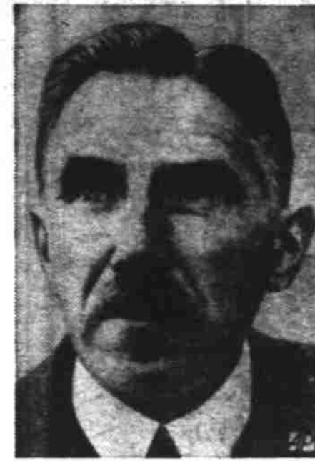
BUSY —Nazi "trouble-shooter" in the Balkans is Franz von Papen (above), German ambassador to Turkey, who recently was called to Berlin for long chats with Hitler. He's rated a shrewd diplomat.