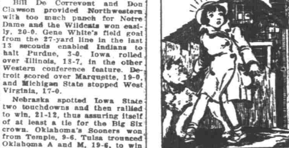
TOOTS AND CASPER