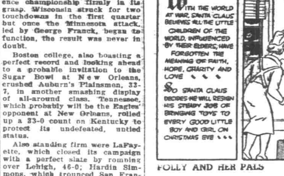
FOLLY AND HER PALS