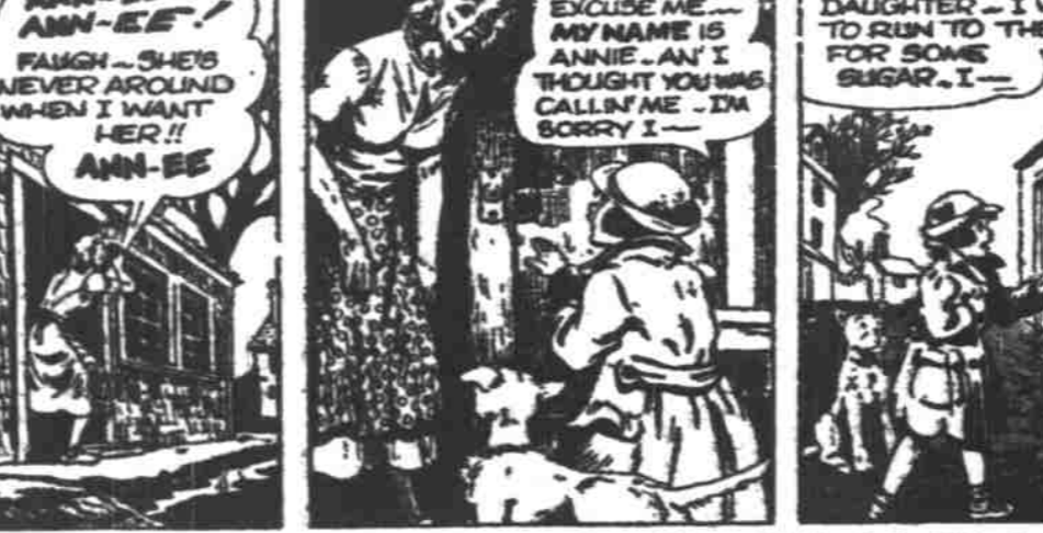
MY LIFE'S IN DANGER