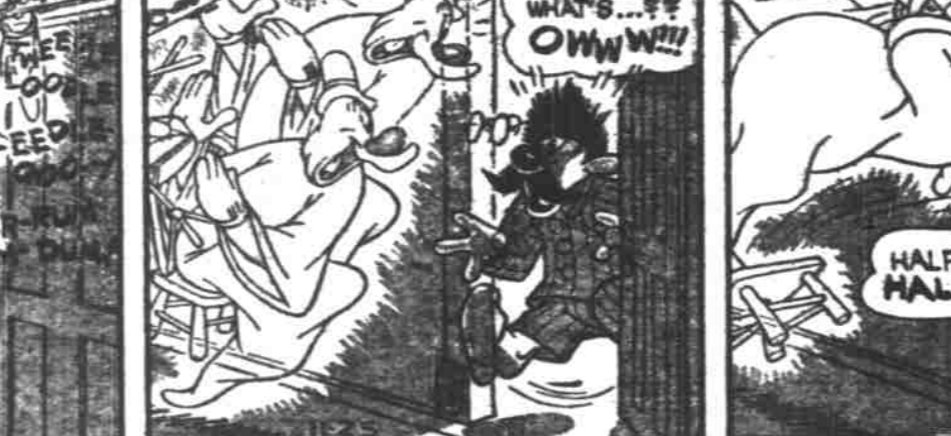
Uneasy Lies Colonel Hooper's Head