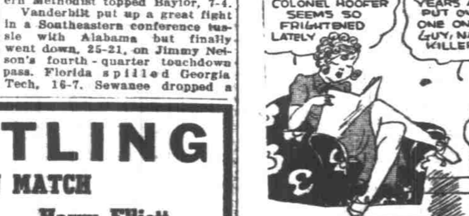
THIMBLE THEATRE—Starring Popeye