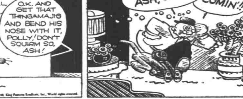
What's in a Name?