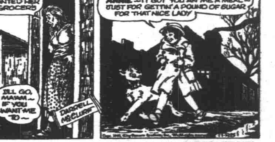
11-25 JIMMY MURPHY