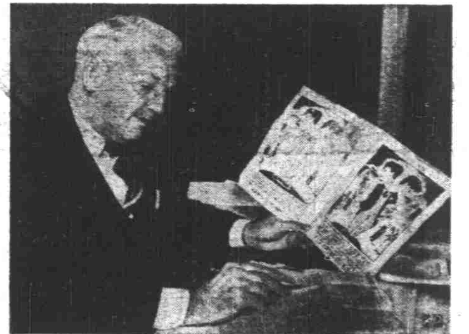
MEMORY LINGERS ON —Though the election's over, a harvest of campaign circulars is still being reaped in Washington by Sen. Guy M. Gillette (D-Ia.), who's making a study of the "smear literature" variously distributed.