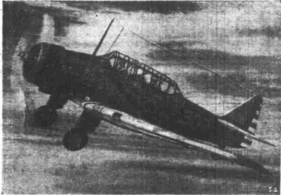
TOO HOT BELOW —While northerners shiver in wintry cold, army flying cadets at Randolph field, Texas, zoom their 450-horsepower training plane up to 9,400 feet to get away from the heat. It was even too warm at 5,000 feet.