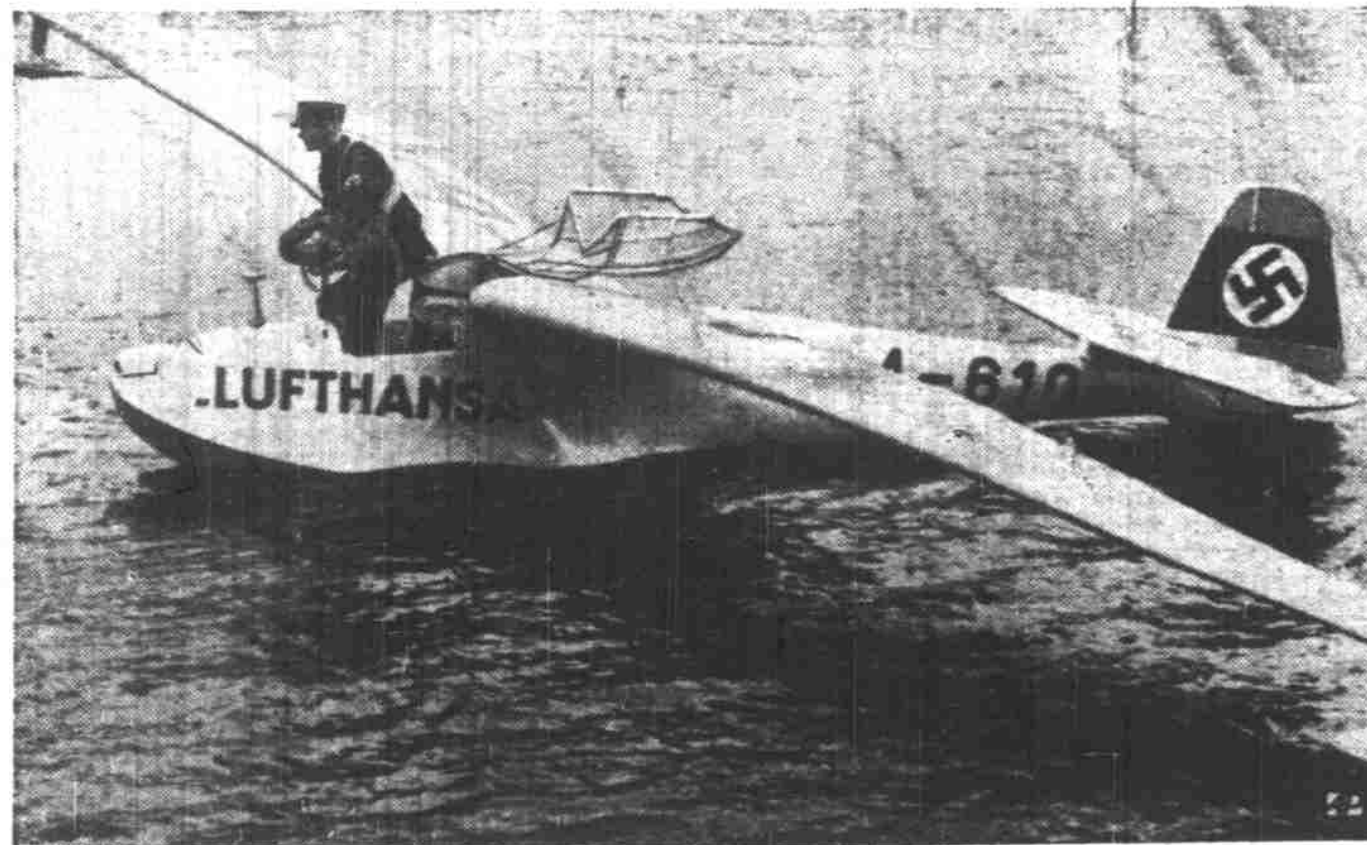
NAZI WATER PLANE —A 700-yard starting rope that's manipulated by a windlass is used for this amphibian glider, shown in Berlin by its inventor, Jachtmann (above).