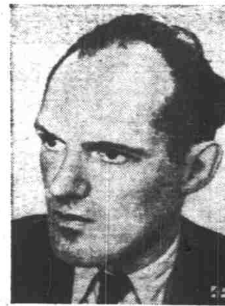
AIRMAN —Almost a youngster in aviation, Willy Messerschmitt, 42, is largely responsible for Germany's air might. He's been building airplanes since early in 1923.