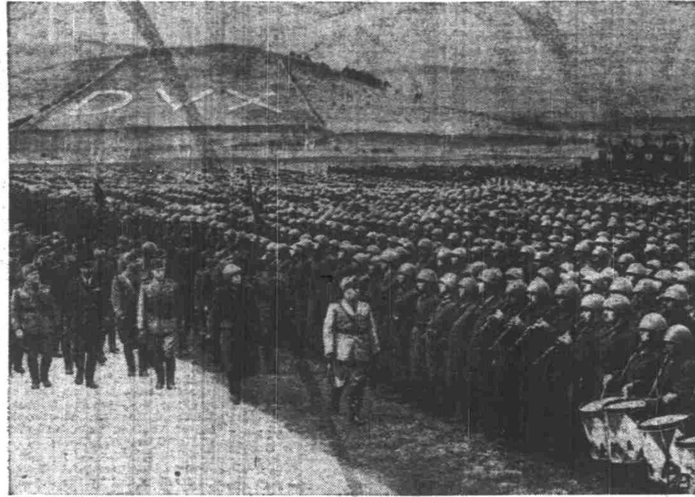
MOUNTAIN HAS A WORD FOR IT —A large "Dux," meaning leader, shone from the mountain as Mussolini (front) reviewed Italian troops stationed near the Yugoslavian border.