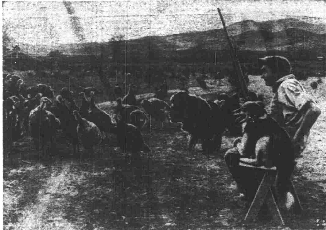
DRUM STICKS 'IN THE RAW' —With turkey days near, vigilant watch for coyotes is kept by herder and his dog at Forrest Benzen's huge turkey ranch near Loveland, Col.