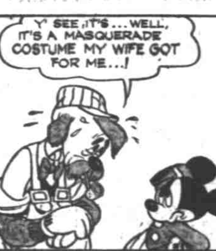
Misery Doesn't Want Company