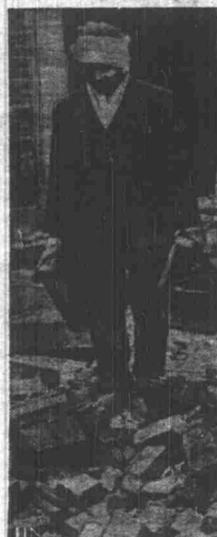
This man had a home—But it's gone today. Head bandaged, injured and forlorn, he leaves his home in London after a Nazi bombing party paid a visit.