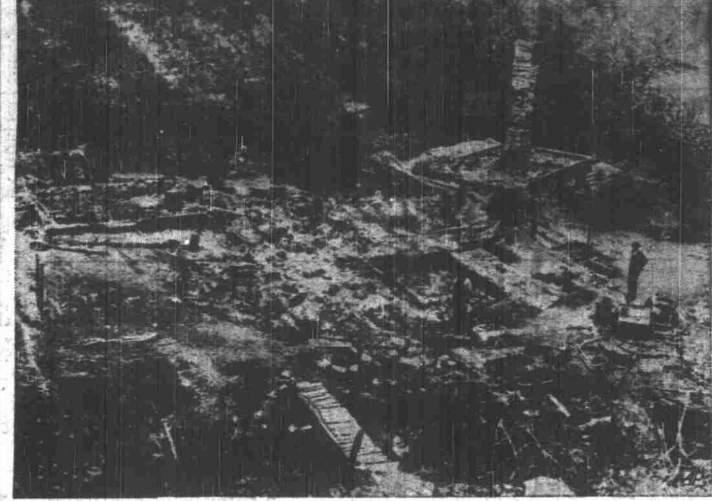
Nine little girls between the ages of three and nine burned to death in wooden buildings of an eastern Kentucky hill country mission school near Jackson, Ky. Blackened ruins of the buildings are shown. bombed in a recent raid, with

School Is Death Trap for Nine Little Girls