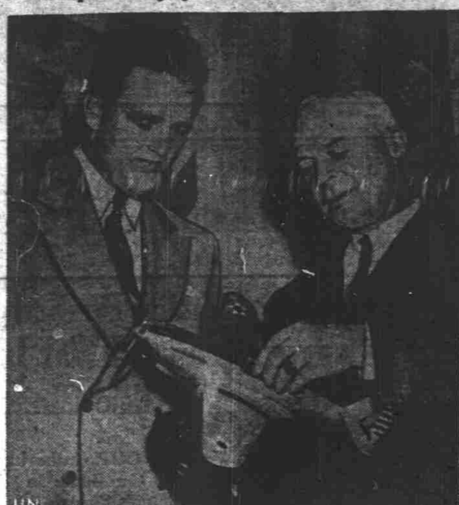
Elliott Roosevelt and General H. H. Arnold

Granting of a captain's commission in the army specialist's reserve to Elliott Roosevelt, son of the president, draws criticism in both congressional and army circles. Critics objected to the granting of the commission to a man without previous military experience. Some officers held that young Roosevelt had obtained in a few minutes what they spent part of a career achieving. Roosevelt was assigned to the air corps and will take up his duties at Wright Field, Dayton, O. He is shown above in Washington with General H. H. Arnold, chief of the air corps, after being granted the commission.