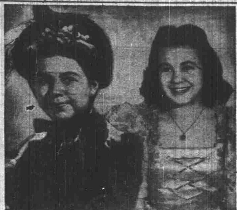
JANE WITHERS as she appears in "The Girl From Avenue A," now showing at the Grand theatre. Companion feature is Lloyd Nolan in "Pier 13."