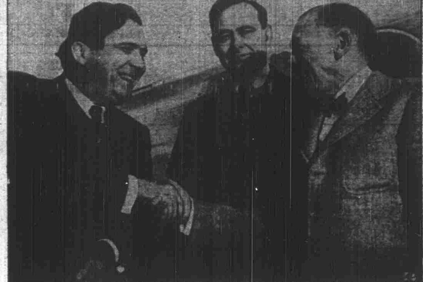
Wendell L. Willkie, republican presidential candidate, giving his running mate, Senator Charles L. McNary of Oregon, a warm handshake at the Indianapolis airport. McNary and Representative Joe Martin had just arrived by air from Washington to confer with Willkie before his departure for a campaign tour of the west.