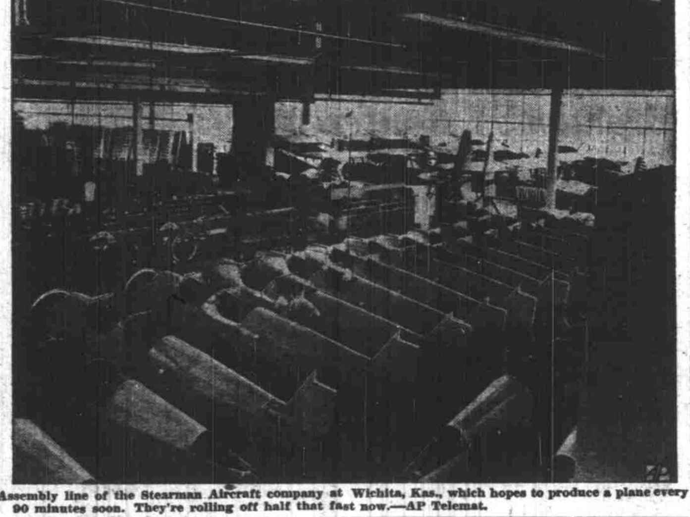
Assembly line of the Stearman Aircraft company at Wichita, Kas., which hopes to produce a plane every 90 minutes soon. They're rolling out half that fast now.