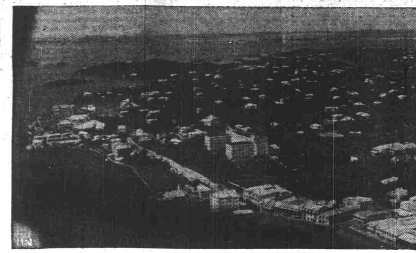
View of Hamilton, Bermuda, from the air