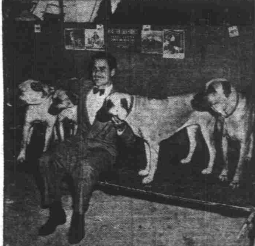
Errol Flynn-recognized as the most popular screen interpreter of characters of high adventure—is seen at the Los Angeles dog show with his prize-winning Rhodesian lion hounds. Errol Flynn's next starring vehicle is Warners' melodramatic pirate romance, "The