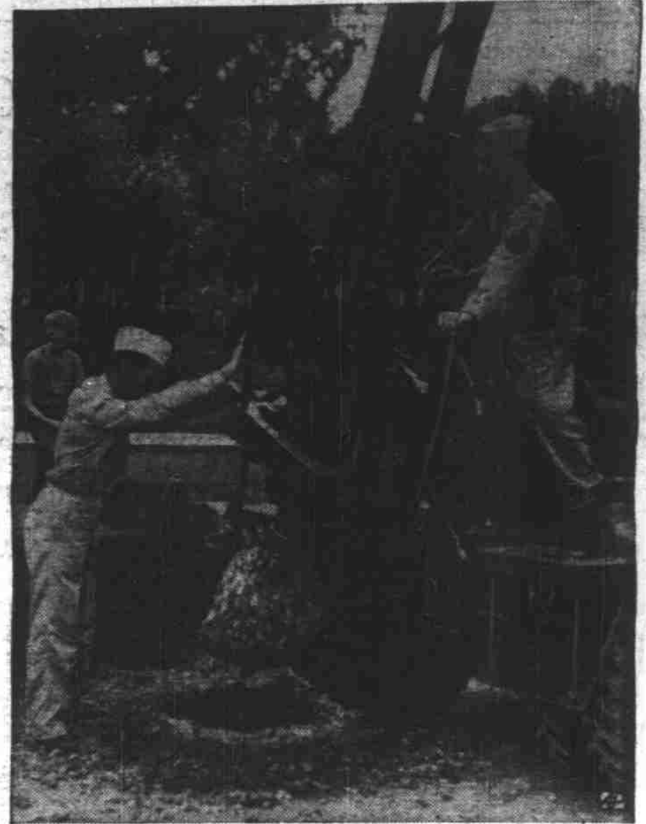
SUBJECT IS BORING —Spade and shovel methods of digging tank traps and other defense holes appear doomed, now that an earth borer such as this from the Buda plant at Harvey, Ill., has been introduced. It is designed for use in warfare also to facilitate the laying of land mines. The men are non-commissioned U. S. army officers testing operation.