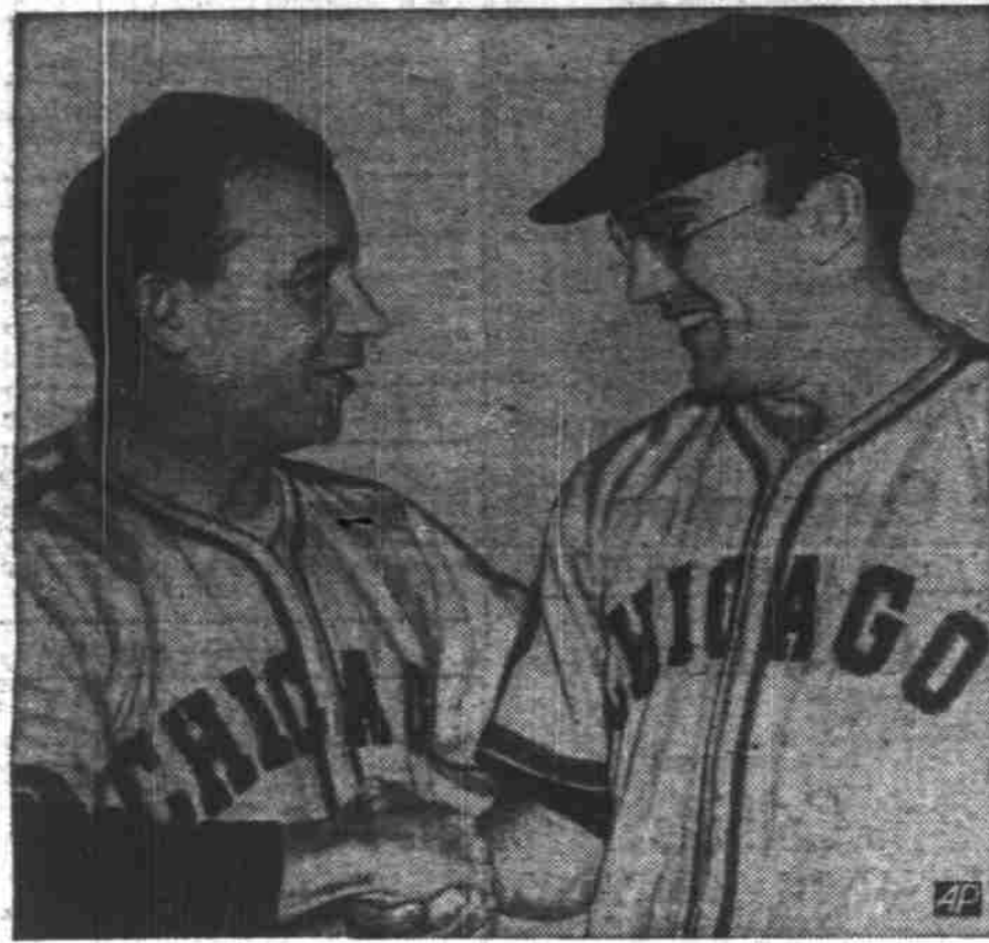
DYKES MAGIC AGAIN —Here's Jimmy Dykes, Chicago White Sox manager, congratulating Bill Dietrich (right), who beat the Red Sox at Boston with five-hit pitching, and then came across with his own winning run in the eighth. The win, 3-2, pulled the second-division White Sox to within one game of the fourth-place Bostonians. It was Bill's eighth win.