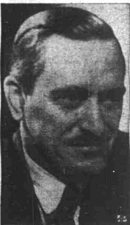
PERENNIAL —Earl Browder, frequent candidate for presidency of the U. S. on the Communist party ticket, is shown in a new photo. He is running again this year.