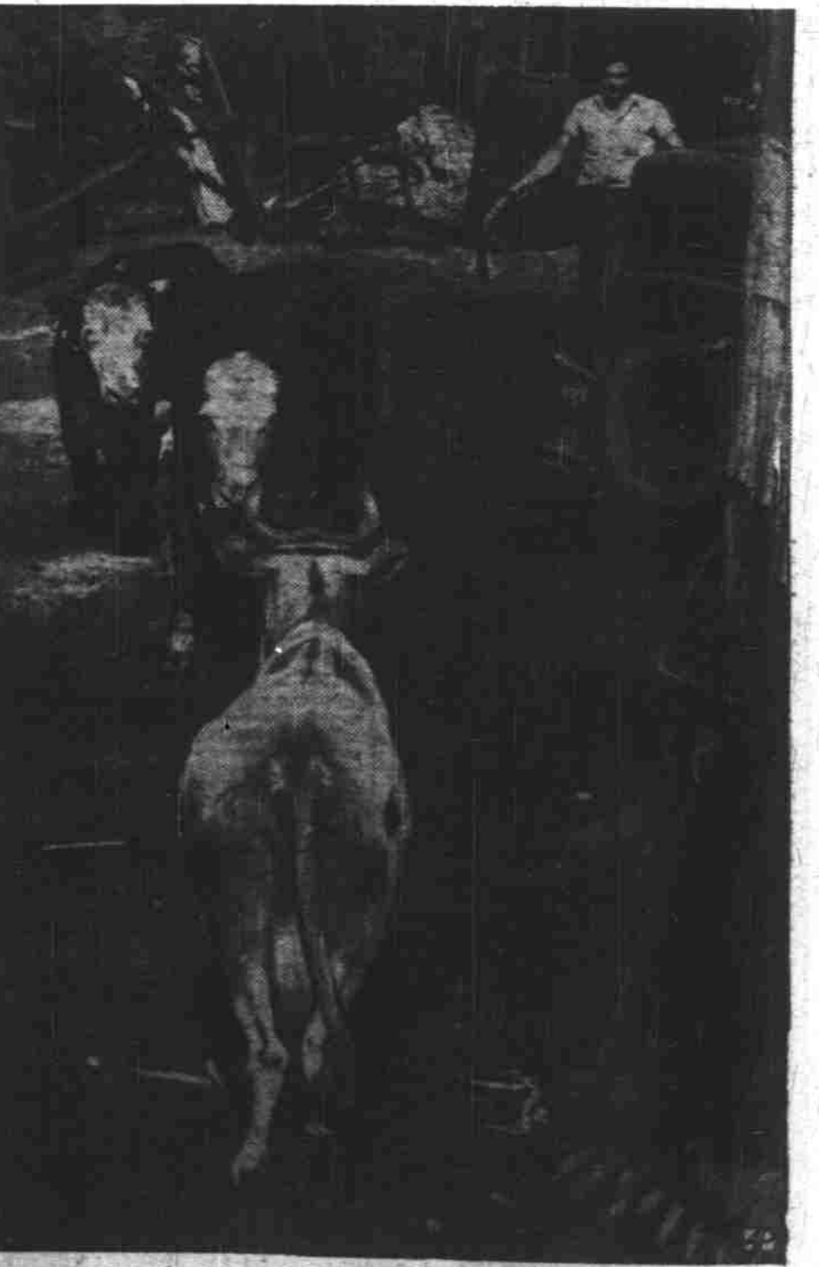
THOSE WILY FEMALES —As deceptive a siren as ever chewed a cud and moo-ed a greeting, this cow lured these ruffian steers out of a junk yard at Somerville, Mass., to which police had chased them, and to a stockyard van for an inevitable fate. It was all in a day's work for Bessy, who's regularly employed as a decoy for runaway steers.