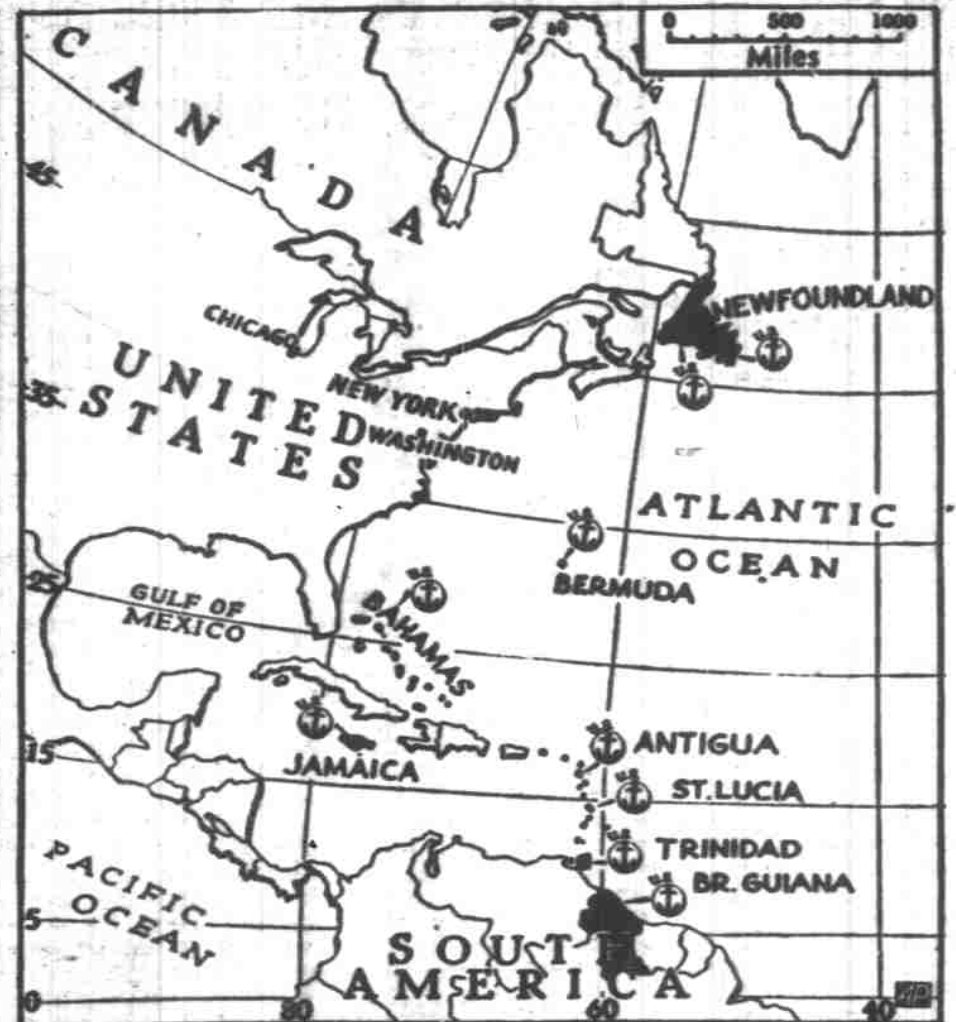
Anchor symbols on above map show location of the sites where the United States has gained rights to establish naval and air bases on the British territory (dark areas), stretching from Newfoundland in the north Atlantic to British Guiana in South America, in exchange for 50 over-age US destroyers, according to an announcement made by President Roosevelt.