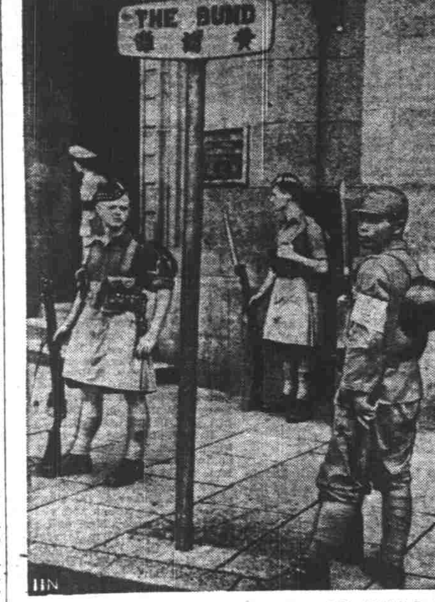
This interesting picture shows two members of the British Seaford Hillanders and a Japanese soldier on guard along the Bund, Shanghai, China. The Hillanders have now gone as the British have withdrawn their armed forces in Shanghai for "service elsewhere" and to appease the Japanese.