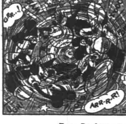
From Producer to Consumer