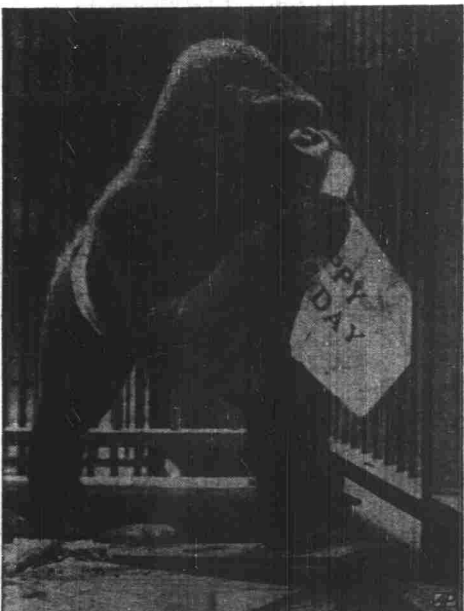
UNHAPPY BIRTHDAY —What Bamboe, the Philadelphia 200's 400-pound gorilla, thinks of birthday parties he made pretty apparent on his 14th anniversary. He threw a 20-pound cake on the floor and chewed up the birthday sign.