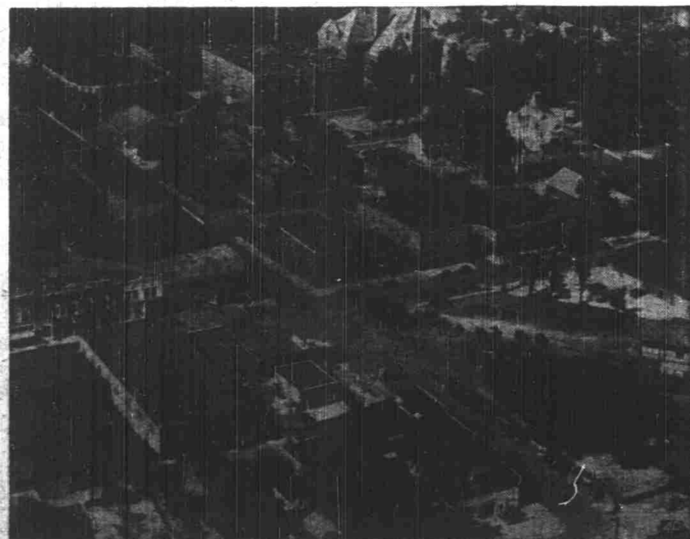
MECCA FOR REPUBLICANS —Downtown Elwood, Ind., spreads out below a plane flying over the town where Wendell Wilkie, Republican presidential nominee, will make his acceptance speech. At the top center is the towered high school house where Wilkie went to classes. "Sleepers" may be roused on the railroad tracks to serve as hotels for some of expected crowd.