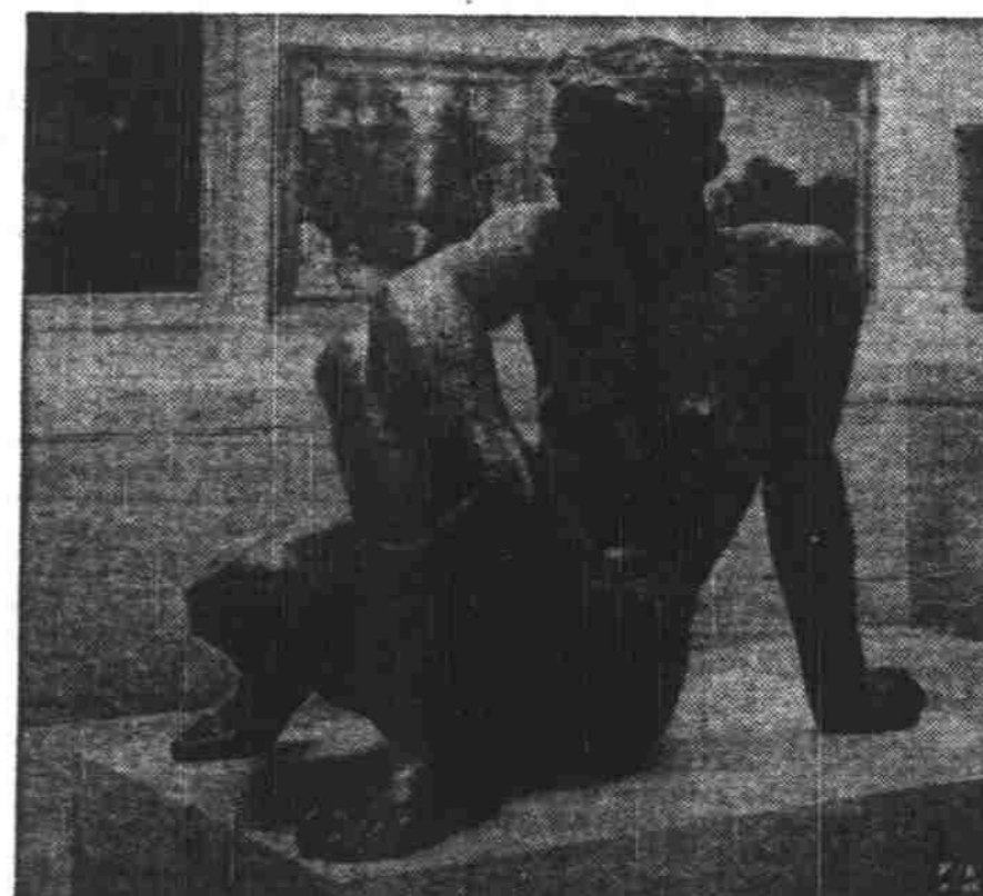
GERMAN CULTURE —"Girl Gazing" is the title of this figure by Fritz Klimsch, seen in a German art exhibition recently opened at Munich. Goebbels, in opening the exhibit, said that "art, even in wartime, is part of Nazi totalitarianism."