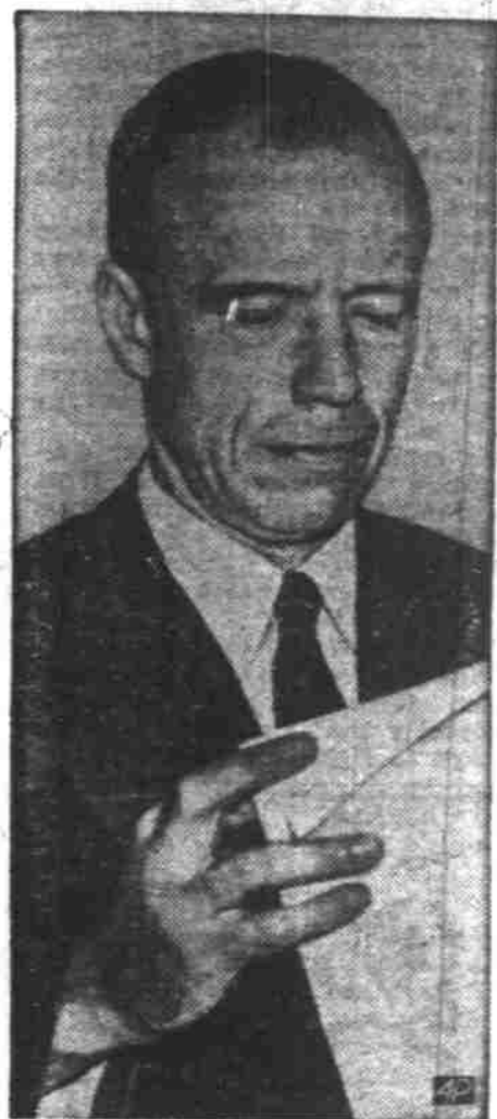
WAR POST —Intent on job is former Judge Robert F. Patterson (above), a native of Glens Falls, N. Y., who's new assistant secretary of war. He succeeded Louis Johnson.