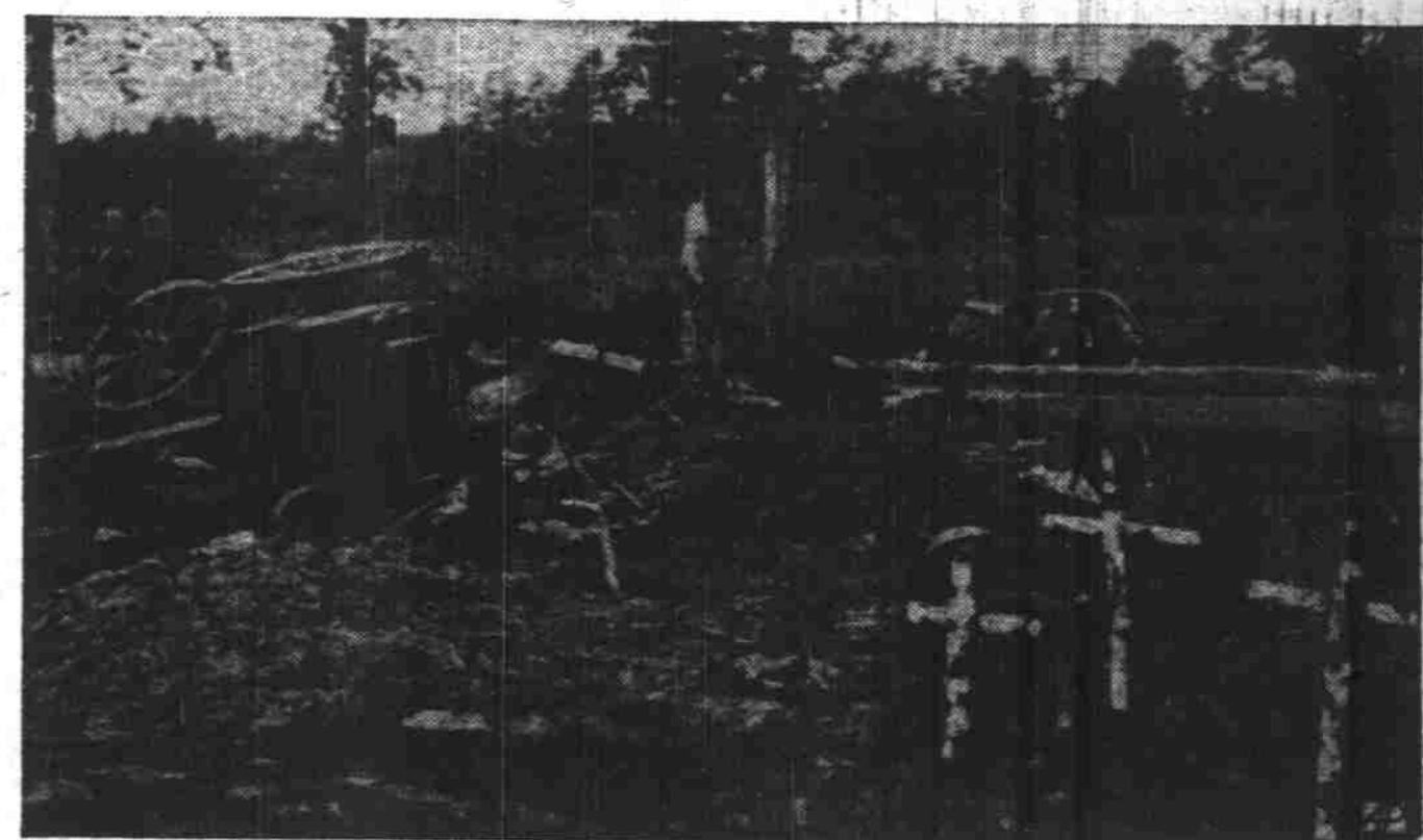
TOMBS OF SOME UNKNOWN SOLDIERS —Birch crosses and soldiers' helmets mark the graves of these poilus who died near Montargis, France, battling to stem the Nazi invasion.