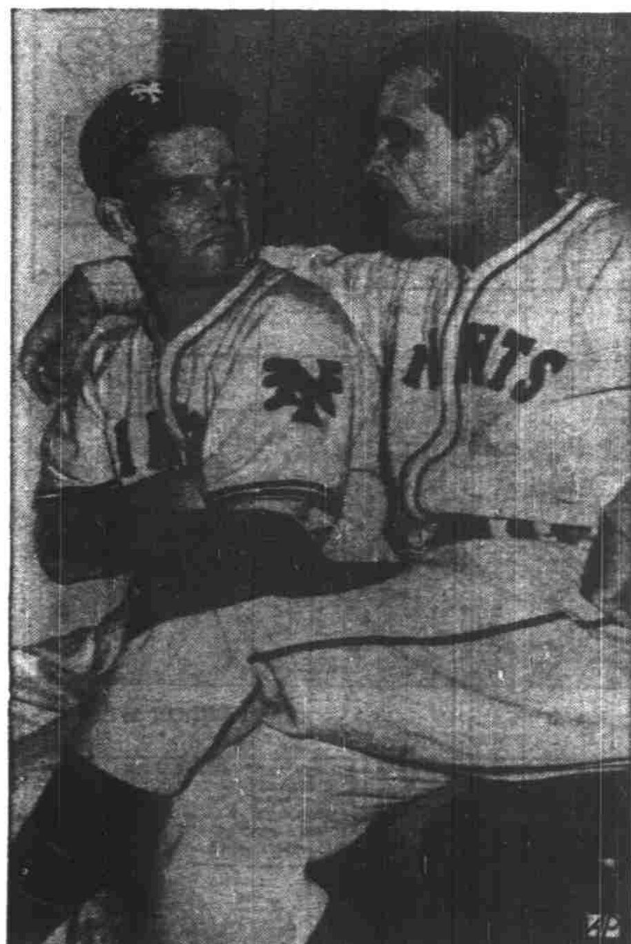
GIANTS DUGOUT —Brought into the Giants' fold 15 years ago by John McGraw, Mel Ott (left) posed in New York with his present boss, Bill Terry, at recent "Mel Ott Night." As a Giant, Ott has hit 369 homers, scored 1,332 runs.