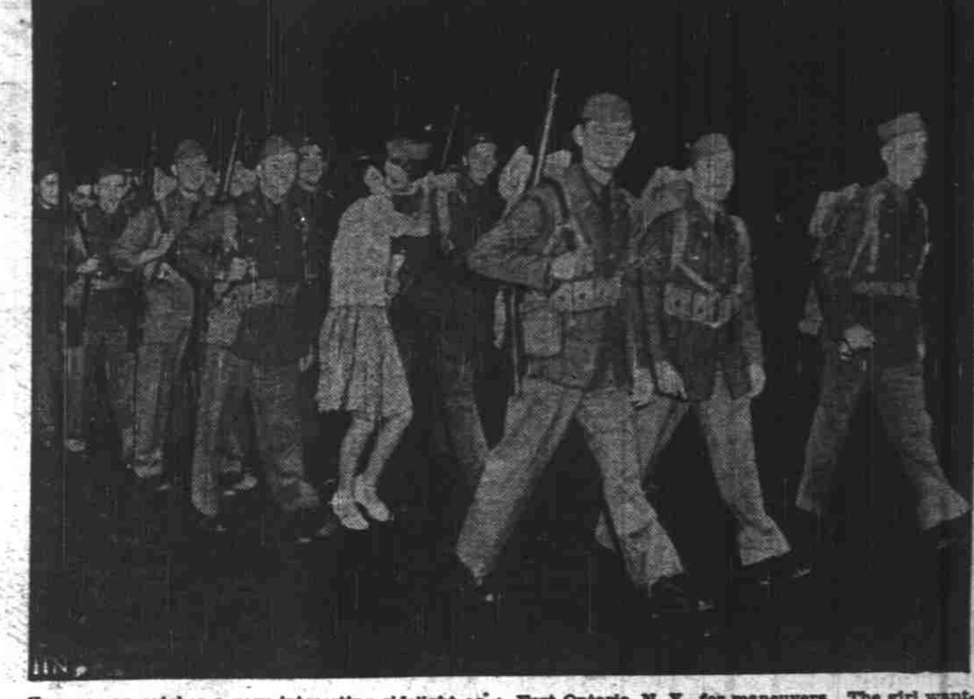
Camerasman catches a very interesting sidelight as Fort Ontario, N. Y., for maneuvers. The girl wanted coast artillery men in New York City depart for | ed one more kiss—and she got it, too!