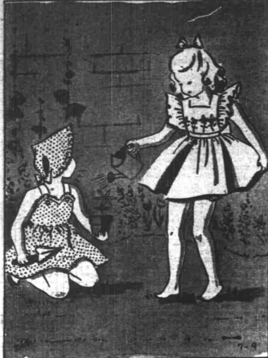
There's no mistaking the supreme desires of this little garden cherub, and she knows one of the principal rules for landing her man.