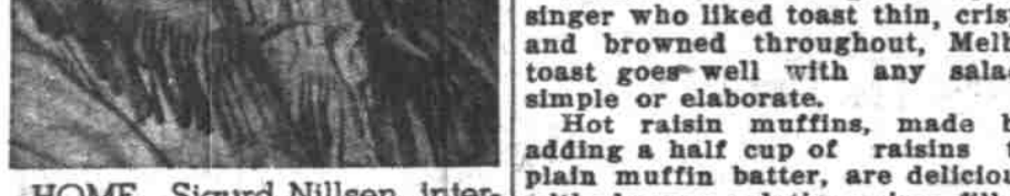
HOME—Sigurd Nilsen, internationally famous bass-baritone, as he appeared in the Centennial pageant singing "Home on the Range." He is a former Silverton man.

A salad served without bread or rolls is like cake without icing. Hot rolls enhance any good salad. Try quick prune rolls with a fruit plate. Or, slice crisp French rolls an inch thick and spread with cheese. Toasted, these cheese slices are perfect with a tossed green salad.