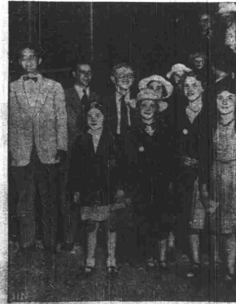
Refugees from Oxford, England, these children are among 97 children and wives of Oxford university faculty members who have arrived at New Haven, Conn., to be guests of Yale university during the war in Europe.