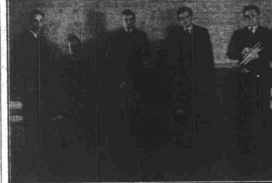
This group from Wheaton college will be at the First Baptist church tomorrow night to present vocal and instrumental music and an evangelistic program.