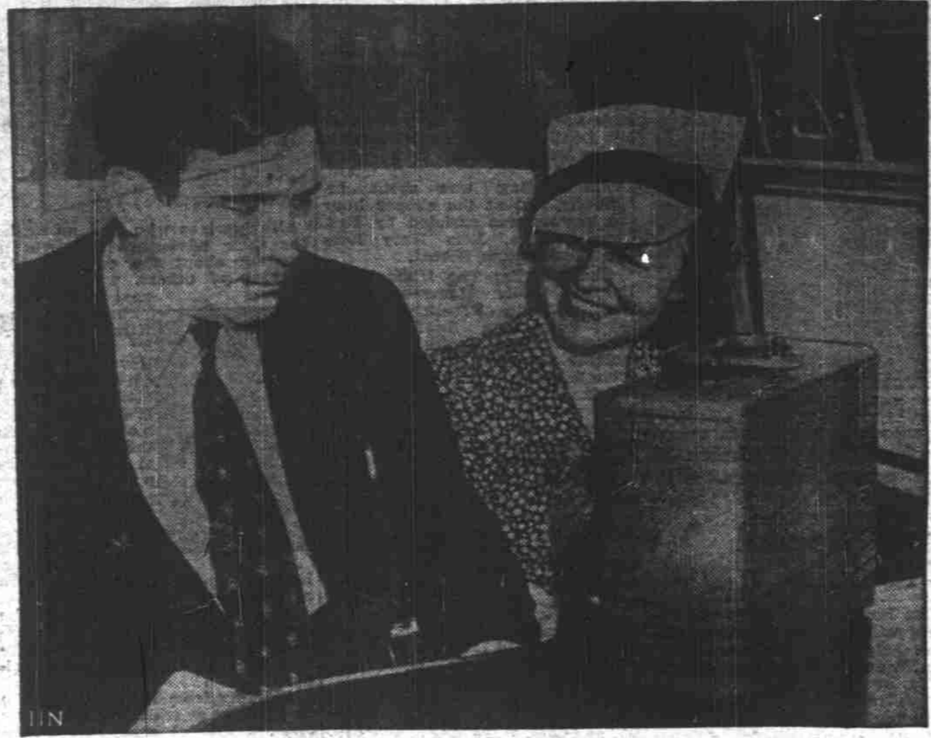
Wendell L. Willkie, the Republican presidential candidate, listens to final sessions of the Democratic national convention while aboard a plane en route from Colorado Springs to Denver. Among other things, Willkie heard that his opponent in November will be President Roosevelt himself.