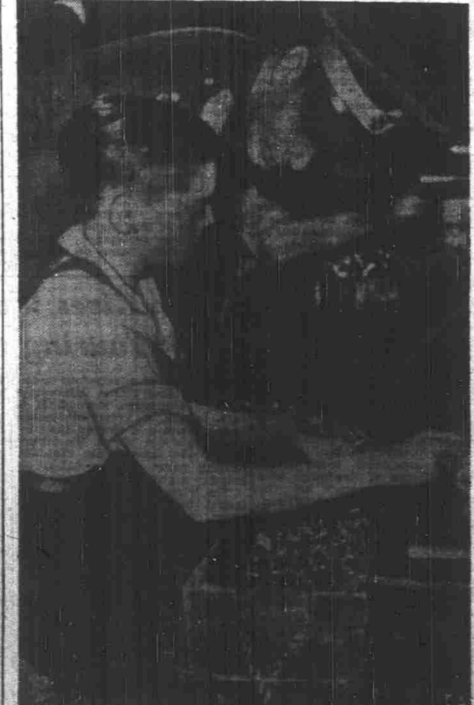
Fifteen-year-old Fluke, said by the British captives to be the youngest boy employed in the bullet-making shop of this Royal Ordnance factory, continued to sort bullets as King George stopped by his machine on an inspection trip.