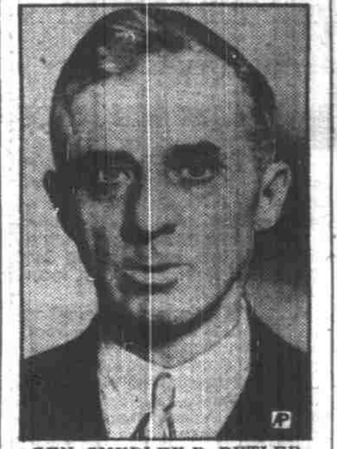
GEN. SMEDLEY D. BUTLER

"Fighting Quaker" Urged Home Army Got Congressional Medal Twice; Organized State Police in Oregon