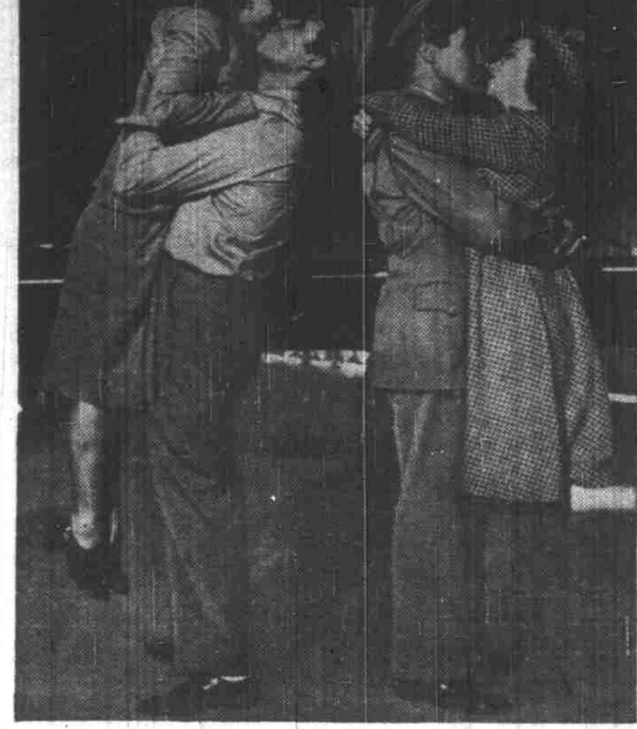
From the appearance of things it seems that Jane Wyman and Virginia Bruce enjoy this scene with Wayne Morris and Bennis Morgan in "Flight Angels," which opens today at the Capitol theatre. Companion picture is Bill "Hopalong" Boyd in "Stage Coach War."