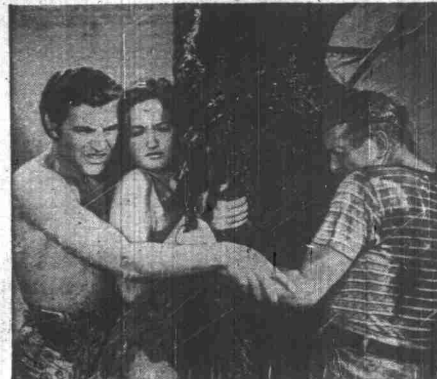
DOROTHY LAMOUR, Robert Preston and Lynne Overman in a scene from "Typhoon" now at the Elsinore plus Hugh Herbert in "La Conga Nights."

Edward Arnold created the character of Diamond Jim on the screen four years ago in the picture of the same name, and revived it for "Lillian Russell," which was directed by Irving Cummings. Gene Markey was associate producer.