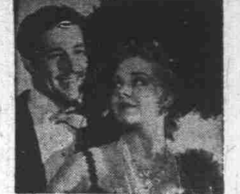
ALICE FAYE and Don Ameche in "Typhoon," held over for another week at the Grand theatre. Also in the cast are Henry Fonda and Edward Arnold.