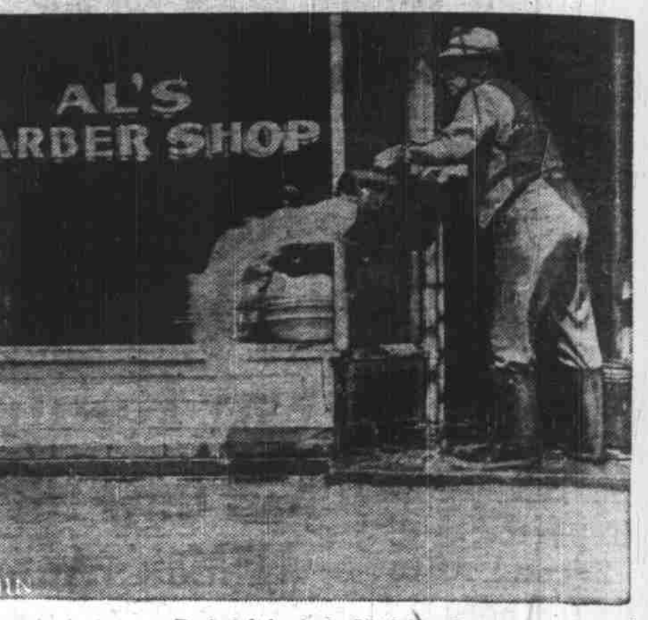
Bucket brigade in Marietta, O. cation lines and did considerable property damage. The above pictures tell the story of flood at Marietta, O., and snowstorm at Eastport, Me.