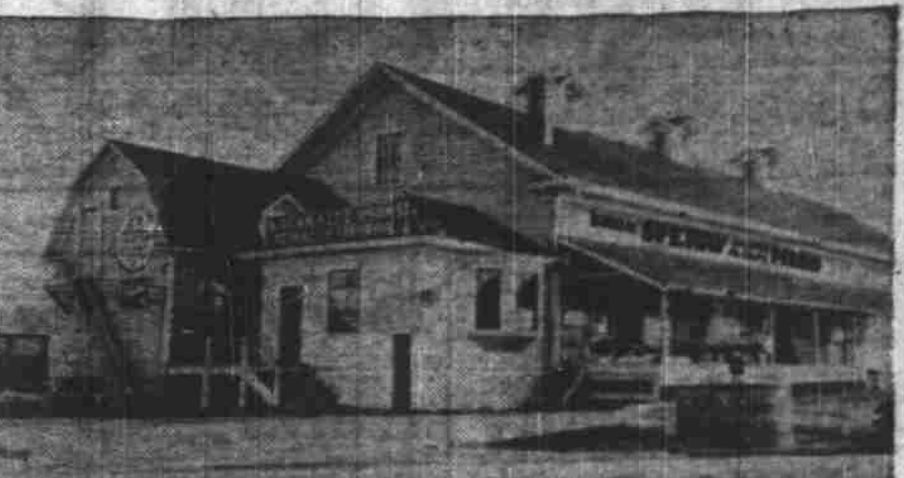
In one of the largest transactions made at Mt. Angel in several years, the Schmalz Warehouse (above) was recently bought by the Farmers Union local and became the Mt. Angel Farmers Union Warehouse Cooperative.