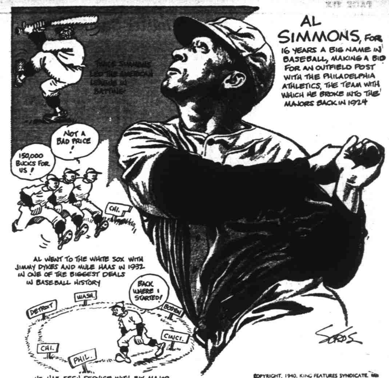
AL WENT TO THE WHITE SOX WITH JIMMY DYNES AND MULE HAAS IN 1932. IN ONE OF THE BIGGEST DEALS IN BASEBALL HISTORY!

NEW YORK, N.Y., March 20.—(AP)—The Brooklyn Dodgers looked like the daffiness boys of old today for one play—and that one play cost them a 4 to 1 loss to the New York Yankees.