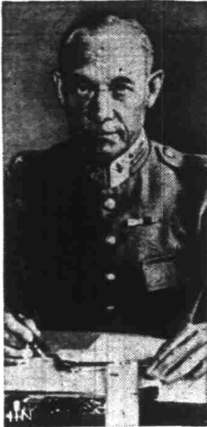
General Per Sylvan

International incidents have placed Sweden in a critical position in Europe today and because of this military defenses are being readied for any possible emergency. Directing the military moves is General Per Sylvan, above, chief of staff of the Swedish army.