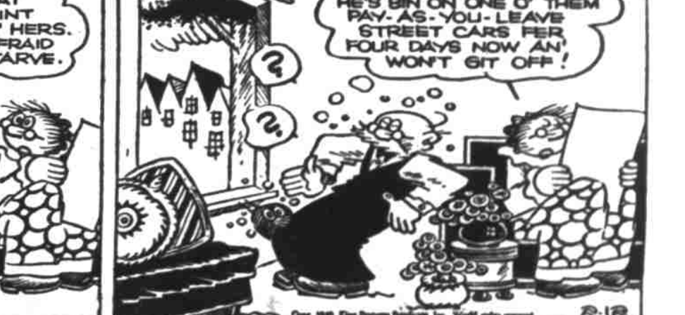
By WALT DISNEY