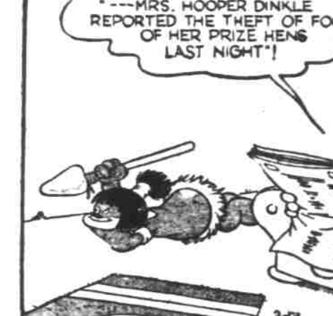
LITTLE ANNIE ROONEY