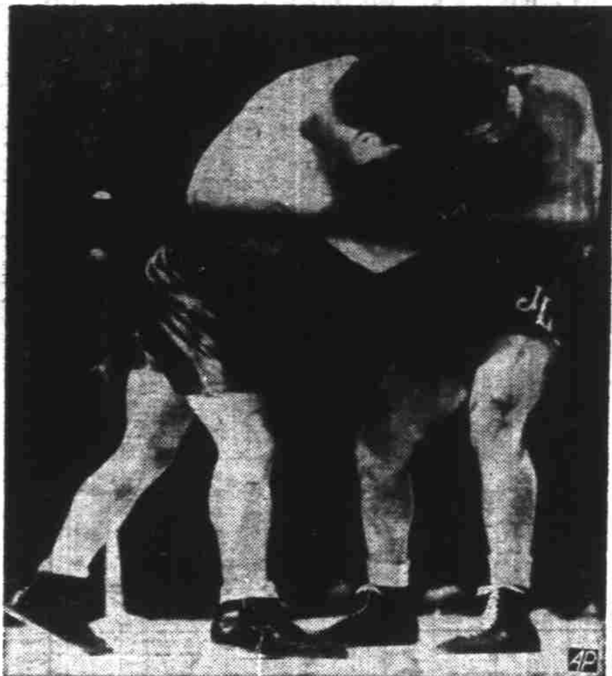
With a two-fisted flurry that caused Joe Louis to blink his eyes and hold on, Challenger Arturo Godoy put the champion on the ropes in the third round melee of fists. This was the third-round scene. Louis came back to take the fight by a decision and retain his title after 15 furious rounds.