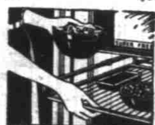
New Stainless Chromium Shelves

. . . come loose and cubes pop out instantly. No hacking no melting under the faucet. No "gadgets" to lose or misplace. Greatest ice convenience ever.