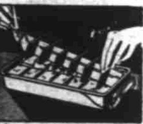
Double Easy Quickcube Trays

Hogg Bros. can show you all the proof of Frigidaire value! Let us show you how the new 1940 Frigidaire keeps food safer and freezes ice faster at the lowest cost in Frigidaire history. See the dozens of features that bring food-convenience to its highest level. Look inside the mechanism and cabinet walls for the story of the sturdy, long-lasting durability and silent efficiency. See how Frigidaire includes many of its greatest de luxe features in even the lower-priced models.