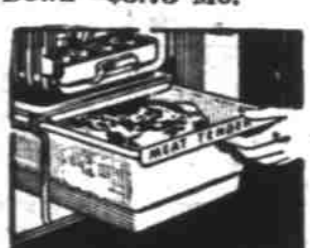
Extra Large Meat Tender

. . . dramatize the beauty of Frigidaire interiors with bright, mirror-smooth luster. Rustless and sanitary. Stay new for years. Can be easily and quickly cleaned in a jiffy.