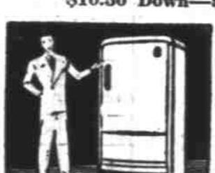
One-Piece Steel Cabinet

. . . slides out like a drawer. Saves food dollars every month by properly protecting all kinds of meat and fowl. Also stores 100% extra supply of ice cubes when entertaining.