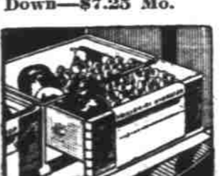
Glass Top Food Hydrator

. . . simplest cold-making mechanism ever built. Self-oiling, self-cooling. Silent, efficient—uses less current than ever before. Exclusive F114 Refrigerant, safest ever known.