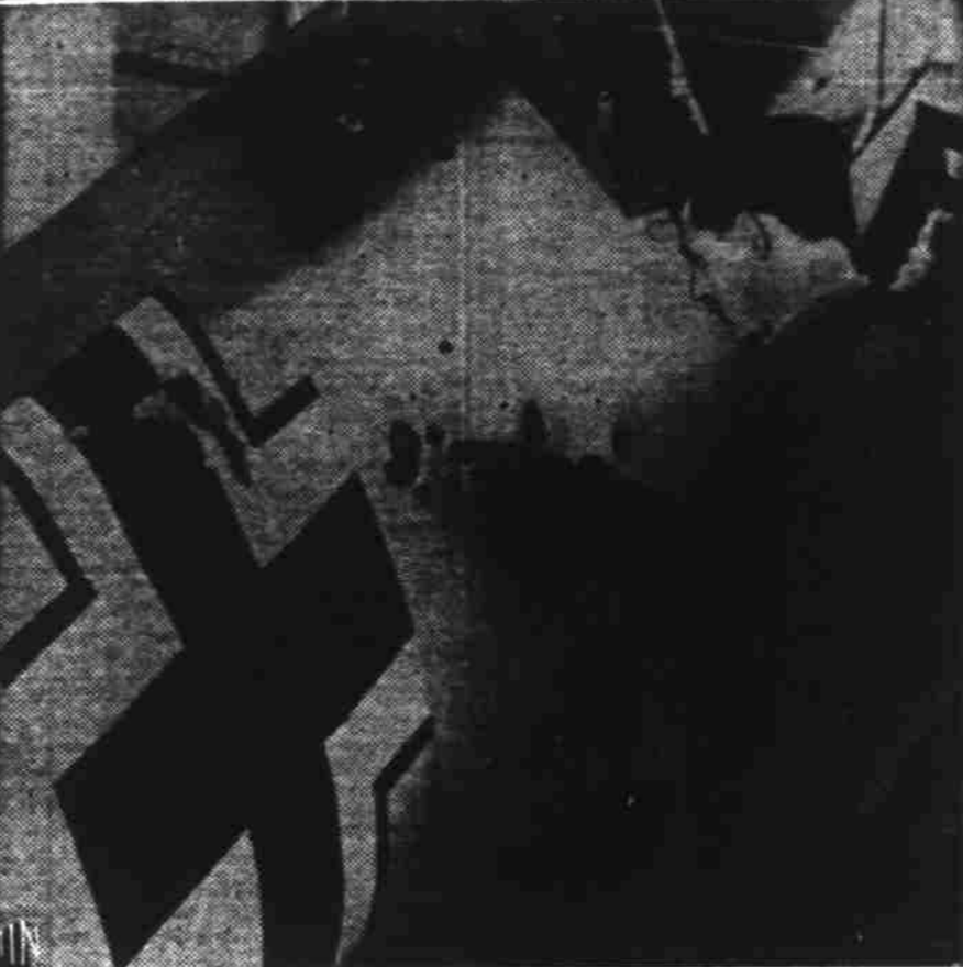
A Nazi pilot counts bullet holes in his fighting plane after returning to his base in Germany. His squadron engaged in an epic battle against 36 British bombers over the North Sea.